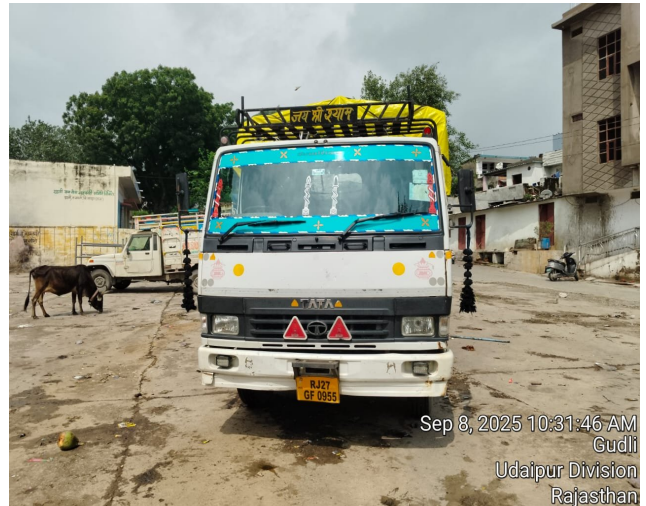
Sep 8, 2025 10:31:46 AM Gudli Udaipur Division Rajasthan