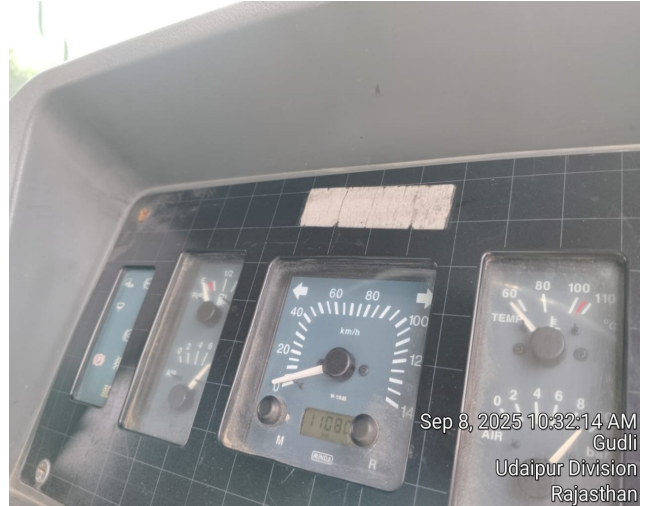
Sep 8, 2025 10:32:14 AM Gudli Udaipur Division Rajasthan