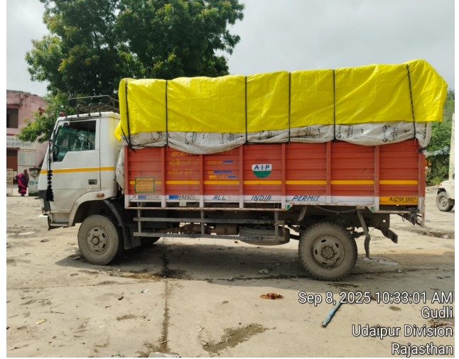
Sep 8, 2025 10:33:01 AM Gudli Udaipur Division Rajasthan