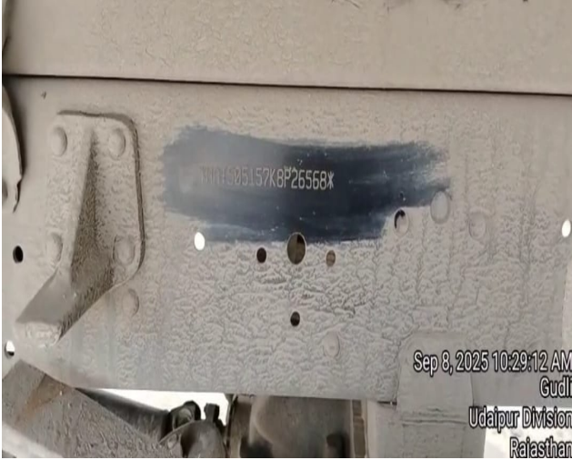
Sep 8, 2025 10:29:12 AM Gudli Udaipur Division Rajasthan

Surveyor & Loss Assessor (SLA / 65869 Valid up to 27-09-27)