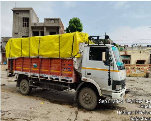
Sep 8, 2025 10:31:57 AM Gudli Udaipur Division Rajasthan