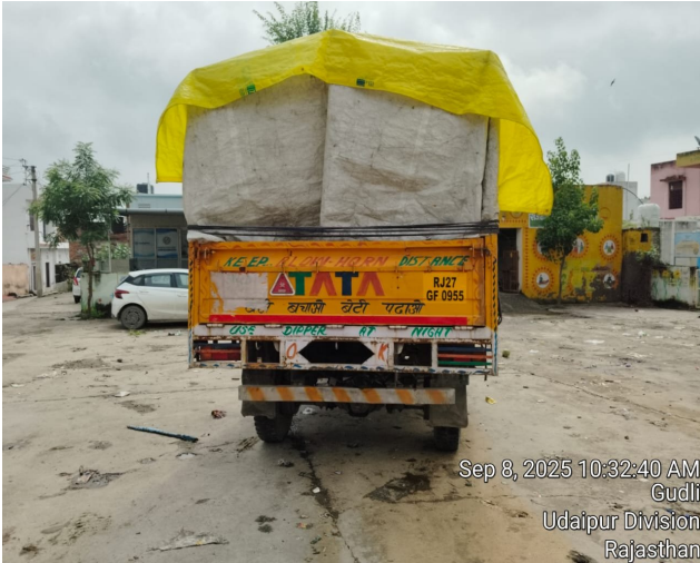
Sep 8, 2025 10:32:40 AM Gudli Udaipur Division Rajasthan