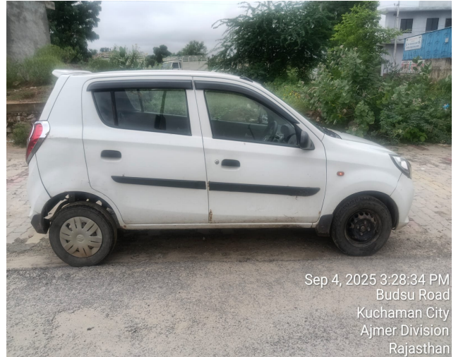
Sep 4, 2025 3:28:34 PM Budsu Road Kuchaman City Ajmer Division Rajasthan