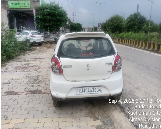
Sep 4, 2025 3:29:13 PM Budsu Road Kuchaman City Ajmer Division Rajasthan