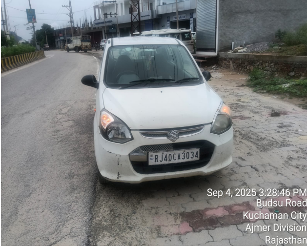
Sep 4, 2025 3:28:46 PM Budsu Road Kuchaman City Ajmer Division Rajasthan

Surveyor & Loss Assessor (SLA / 65869 Valid up to 27-09-27)