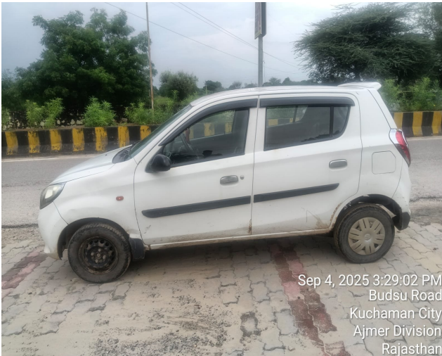
Sep 4, 2025 3:29:02 PM Budsu Road Kuchaman City Ajmer Division Rajasthan