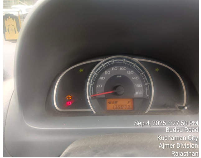
Sep 4, 2025 3:27:50 PM Budsu Road Kuchaman City Ajmer Division Rajasthan