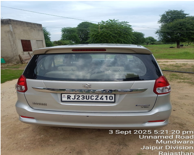
3 Sept 2025 5:21:20 pm Unnamed Road Mundwara Jaipur Division Rajasthan