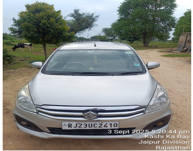
3 Sept 2025 5:20:44 pm Kashi Ka Bas Jaipur Division Rajasthan