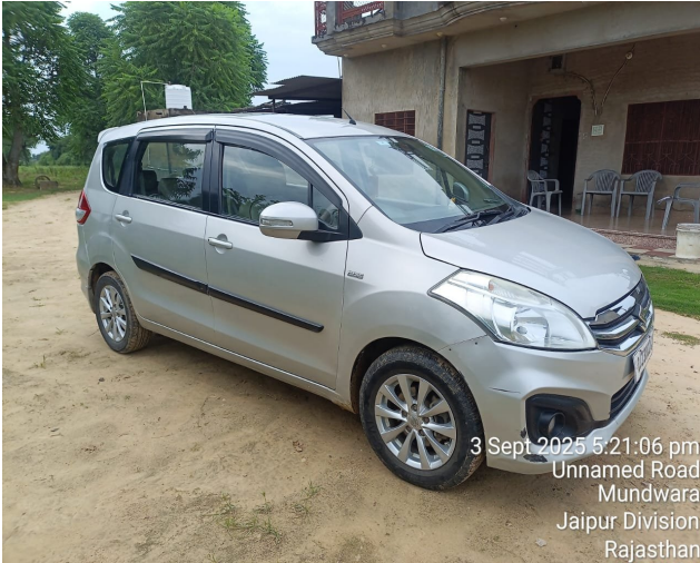
3 Sept 2025 5:21:06 pm Unnamed Road Mundwara Jaipur Division Rajasthan