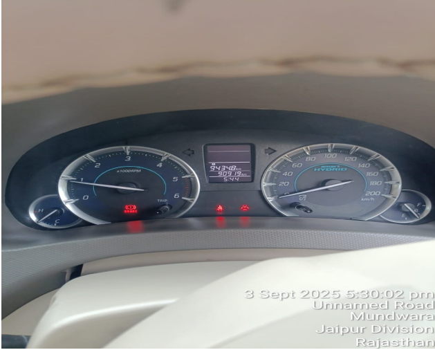
3 Sept 2025 5:30:02 pm Unnamed Road Mundwara Jaipur Division Rajasthan

Surveyor & Loss Assessor (SLA / 65869 Valid up to 27-09-27)