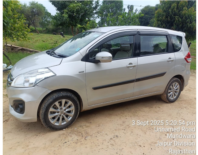
3 Sept 2025 5:20:54 pm Unnamed Road Mundwara Jaipur Division Rajasthan