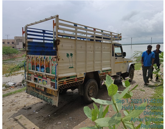
Sep 1, 2025 11:42:02 Hafiz Basir Colony Didwana Ajmer Division Rajasthan