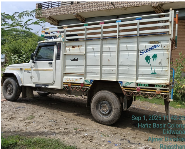
Sep 1, 2025 11:42:22 Hafiz Basir Colony Didwana Ajmer Division Rajasthan