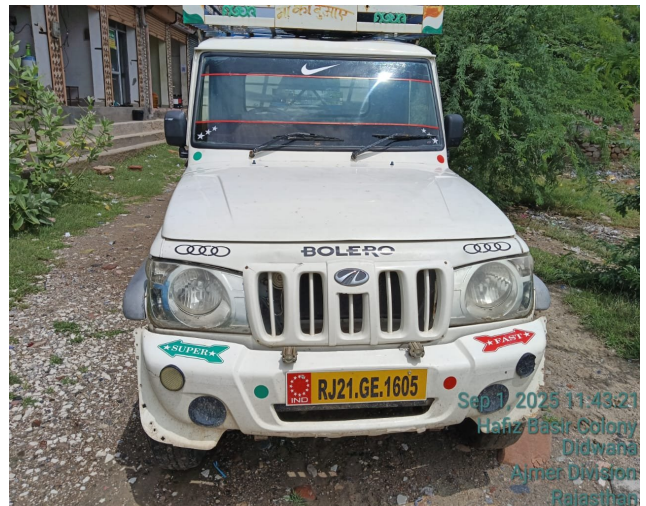
Sep 1, 2025 11:43:21 Hafiz Basir Colony Didwana Ajmer Division Rajasthan