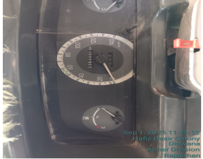
Sep 1, 2025 11:41:52 Hafiz Basir Colony Didwana Ajmer Division Rajasthan