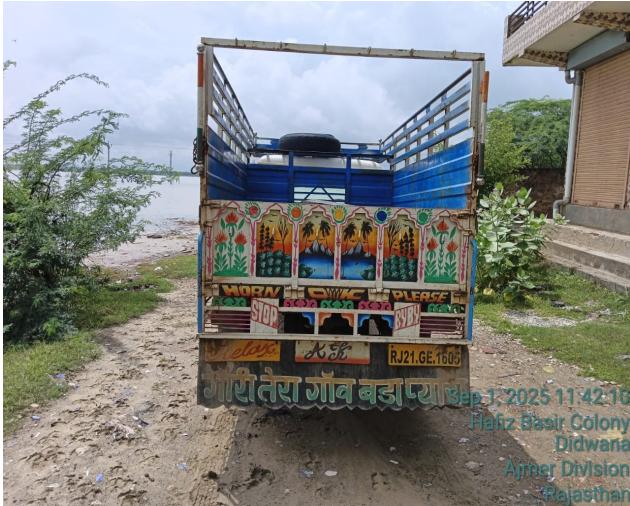
Sep 1, 2025 11:42:10 Hafiz Basir Colony Didwana Ajmer Division Rajasthan