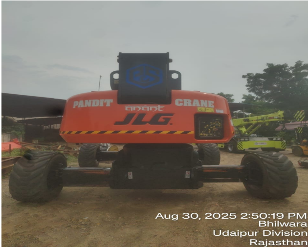
Aug 30, 2025 2:50:19 PM Bhilwara Udaipur Division Rajasthan