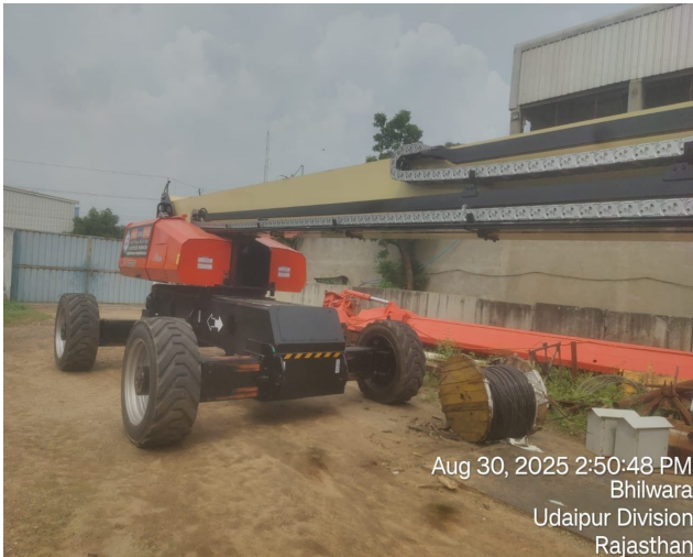
Aug 30, 2025 2:50:48 PM Bhilwara Udaipur Division Rajasthan