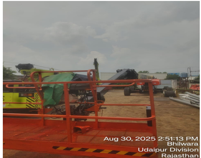
Aug 30, 2025 2:51:13 PM Bhilwara Udaipur Division Rajasthan