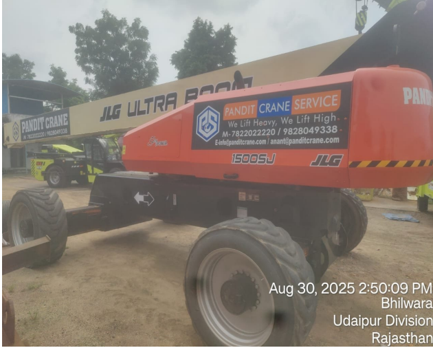
Aug 30, 2025 2:50:09 PM Bhilwara Udaipur Division Rajasthan

Surveyor & Loss Assessor (SLA / 65869 Valid up to 27-09-27)