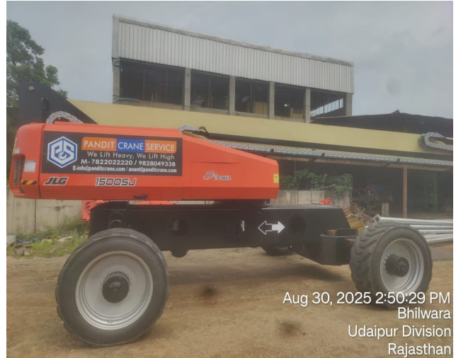
Aug 30, 2025 2:50:29 PM Bhilwara Udaipur Division Rajasthan