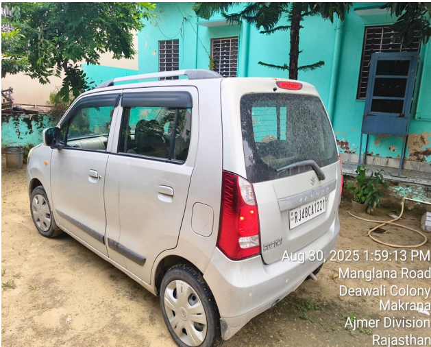
Aug 30, 2025 1:59:13 PM Manglana Road Deawali Colony Makrana Ajmer Division Rajasthan