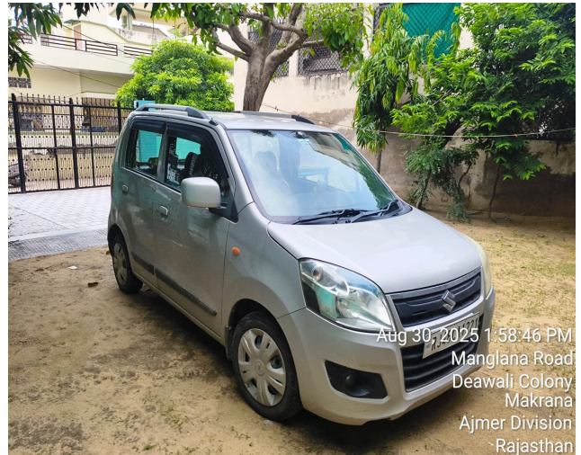
Aug 30, 2025 1:58:46 PM Manglana Road Deawali Colony Makrana Ajmer Division Rajasthan