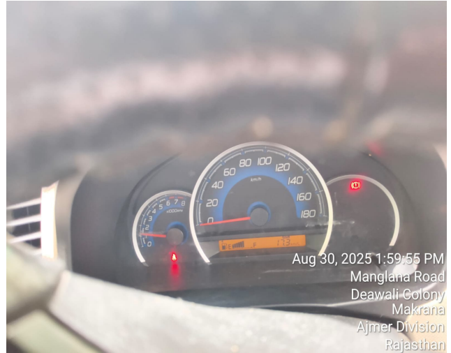
Aug 30, 2025 1:59:55 PM Manglana Road Deawali Colony Makrana Ajmer Division Rajasthan