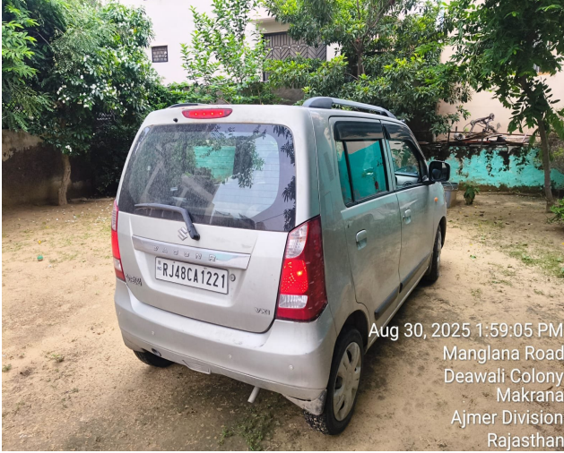
Aug 30, 2025 1:59:05 PM Manglana Road Deawali Colony Makrana Ajmer Division Rajasthan

Surveyor & Loss Assessor (SLA / 65869 Valid up to 27-09-27)