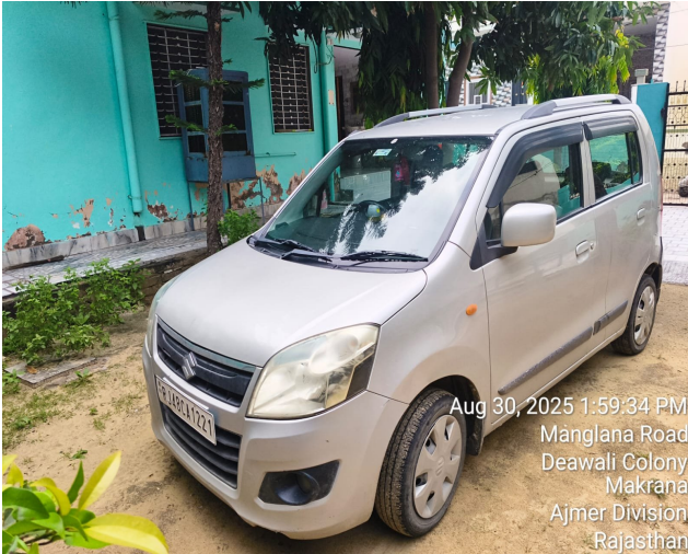
Aug 30, 2025 1:59:34 PM Manglana Road Deawali Colony Makrana Ajmer Division Rajasthan