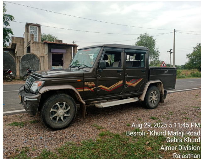
Aug 29, 2025 5:11:45 PM Besroli - Khurd Mataji Road Gehra Khurd Ajmer Division Rajasthan