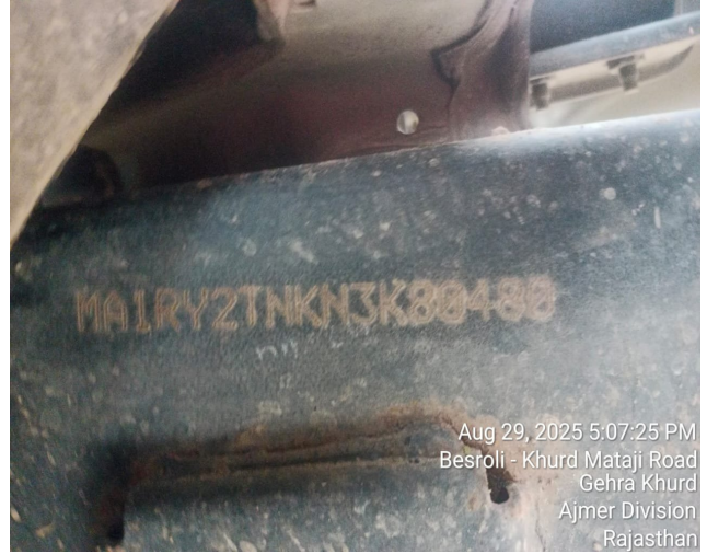
Aug 29, 2025 5:07:25 PM Besroli - Khurd Mataji Road Gehra Khurd Ajmer Division Rajasthan