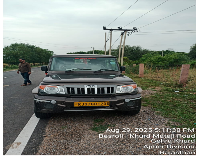
Aug 29, 2025 5:11:38 PM Besroli - Khurd Mataji Road Gehra Khurd Ajmer Division Rajasthan