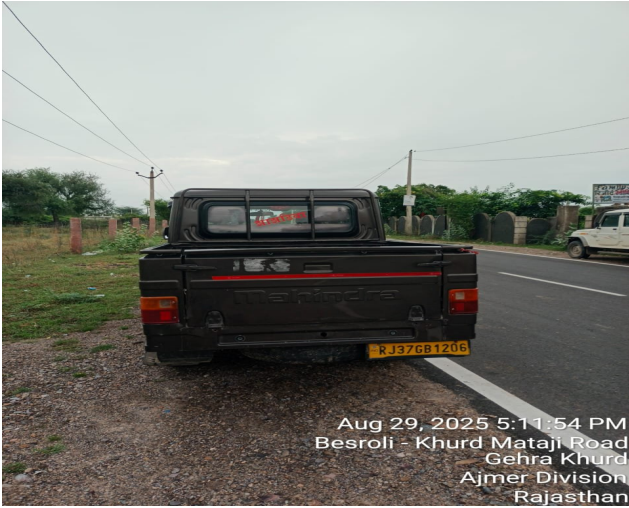
Aug 29, 2025 5:11:54 PM Besroli - Khurd Mataji Road Gehra Khurd Ajmer Division Rajasthan