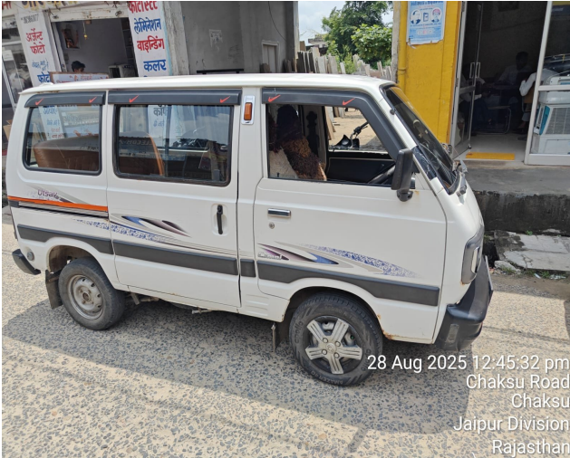
28 Aug 2025 12:45:32 pm Chaksu Road Chaksu Jaipur Division Rajasthan