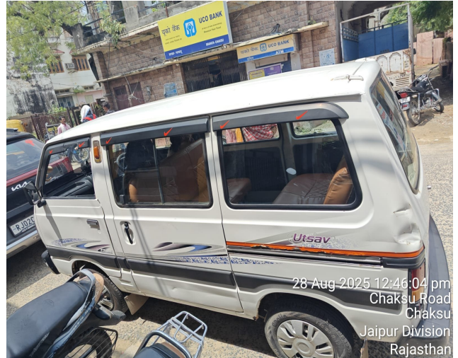
28 Aug 2025 12:46:04 pm Chaksu Road Chaksu Jaipur Division Rajasthan