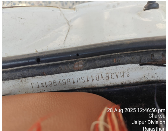
28 Aug 2025 12:46:56 pm Chaksu Jaipur Division Rajasthan