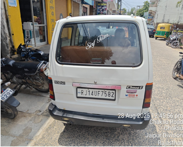
28 Aug 2025 12:45:56 pm Chaksu Road Chaksu Jaipur Division Rajasthan

Surveyor & Loss Assessor (SLA / 65869 Valid up to 27-09-27)