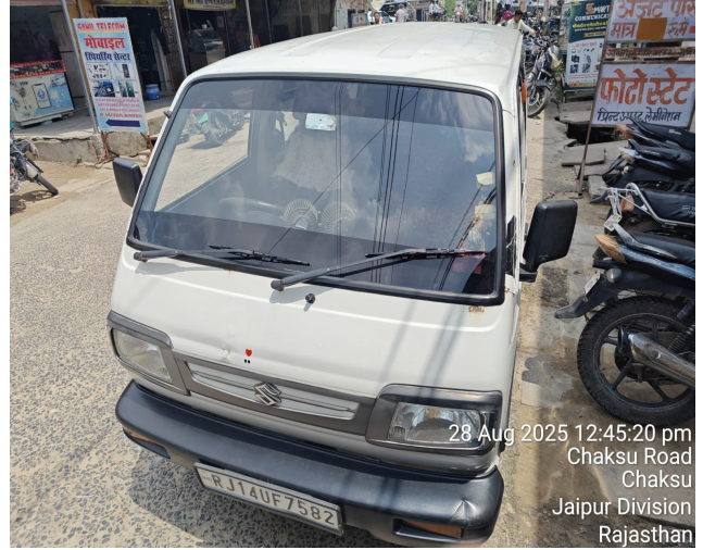
28 Aug 2025 12:45:20 pm Chaksu Road Chaksu Jaipur Division Rajasthan