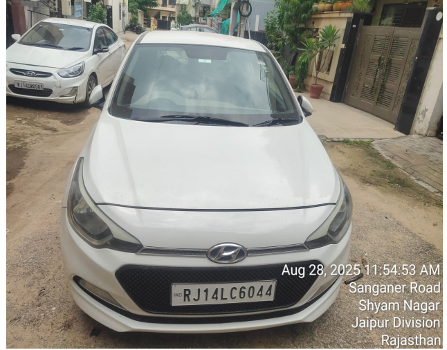
Aug 28, 2025 11:54:53 AM Sanganer Road Shyam Nagar Jaipur Division Rajasthan