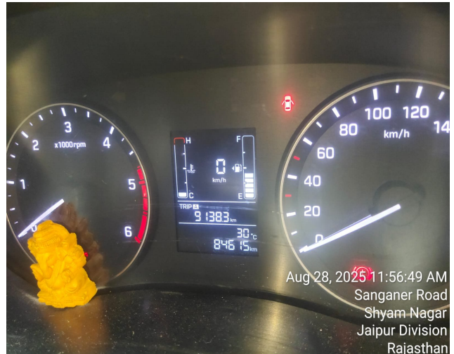
Aug 28, 2025 11:56:49 AM Sanganer Road Shyam Nagar Jaipur Division Rajasthan