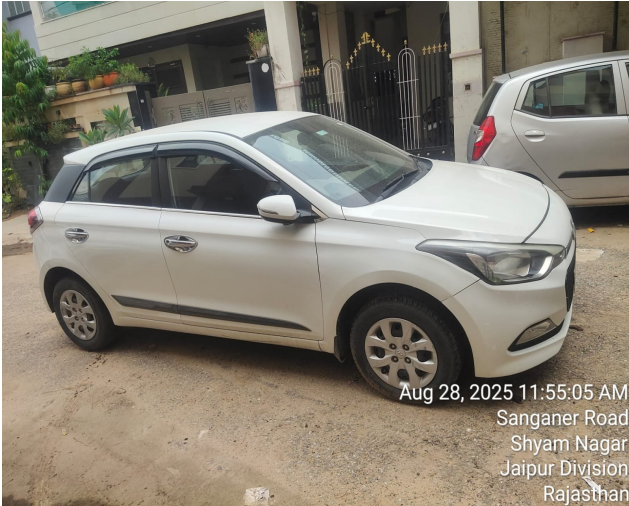
Aug 28, 2025 11:55:05 AM Sanganer Road Shyam Nagar Jaipur Division Rajasthan