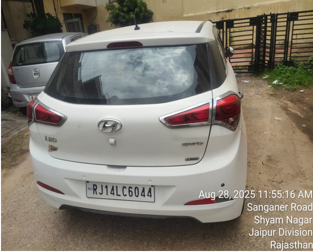
Aug 28, 2025 11:55:16 AM Sanganer Road Shyam Nagar Jaipur Division Rajasthan

Surveyor & Loss Assessor (SLA / 65869 Valid up to 27-09-27)