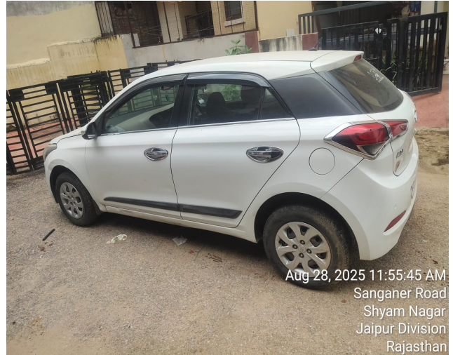
Aug 28, 2025 11:55:45 AM Sanganer Road Shyam Nagar Jaipur Division Rajasthan