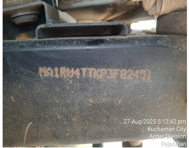
27-Aug-2025 5:12:42 pm Kuchaman City Ajmer Division Rajasthan