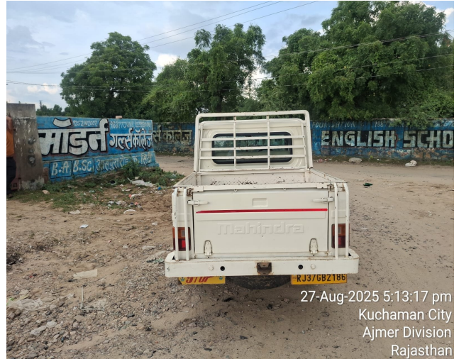
27-Aug-2025 5:13:17 pm Kuchaman City Ajmer Division Rajasthan