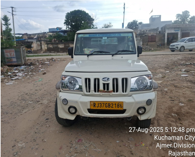
27-Aug-2025 5:12:48 pm Kuchaman City Ajmer Division Rajasthan