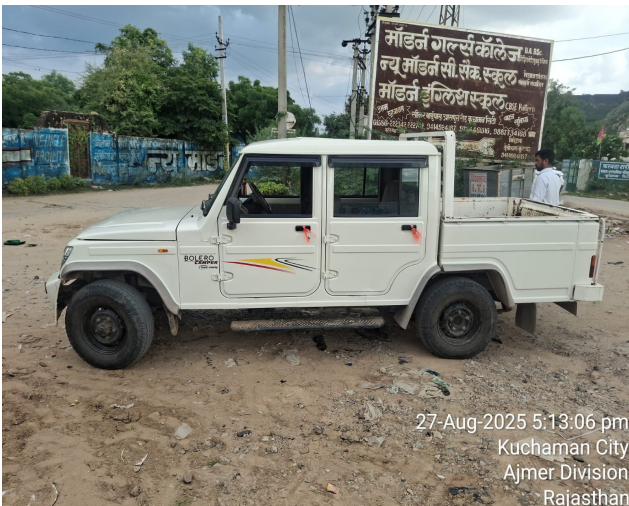
27-Aug-2025 5:13:06 pm Kuchaman City Ajmer Division Rajasthan