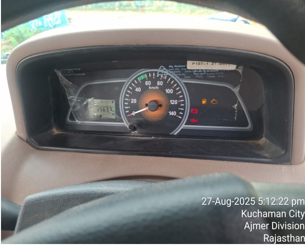
27-Aug-2025 5:12:22 pm Kuchaman City Ajmer Division Rajasthan

Surveyor & Loss Assessor (SLA / 65869 Valid up to 27-09-27)