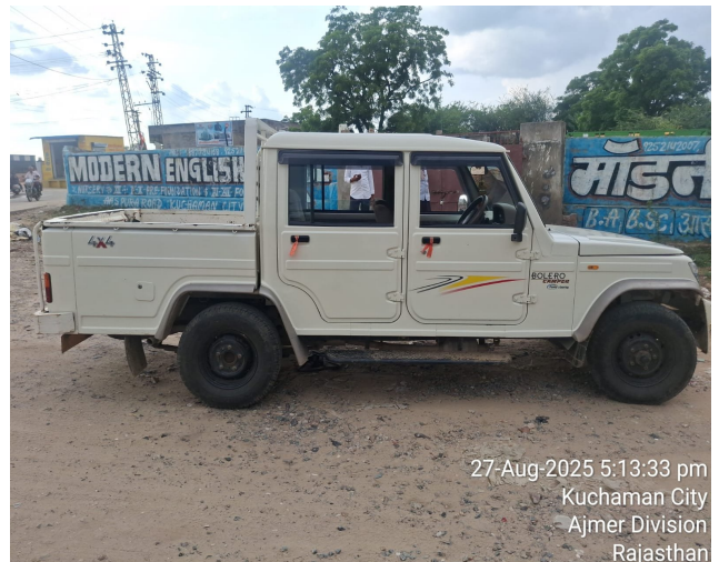
27-Aug-2025 5:13:33 pm Kuchaman City Ajmer Division Rajasthan