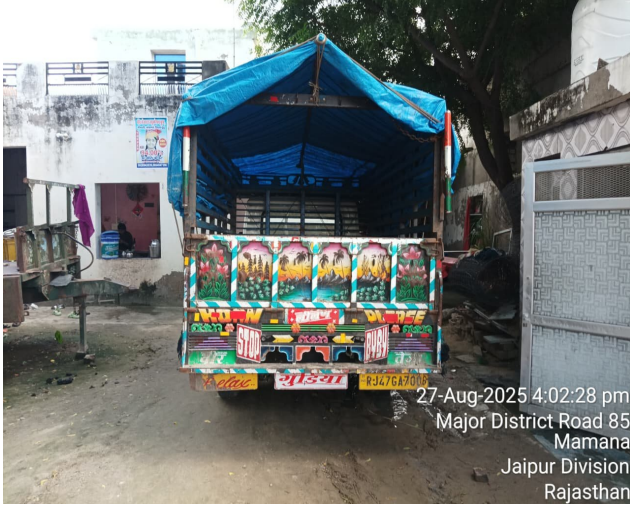
27-Aug-2025 4:02:28 pm Major District Road 85 Mamana Jaipur Division Rajasthan

Surveyor & Loss Assessor (SLA / 65869 Valid up to 27-09-27)