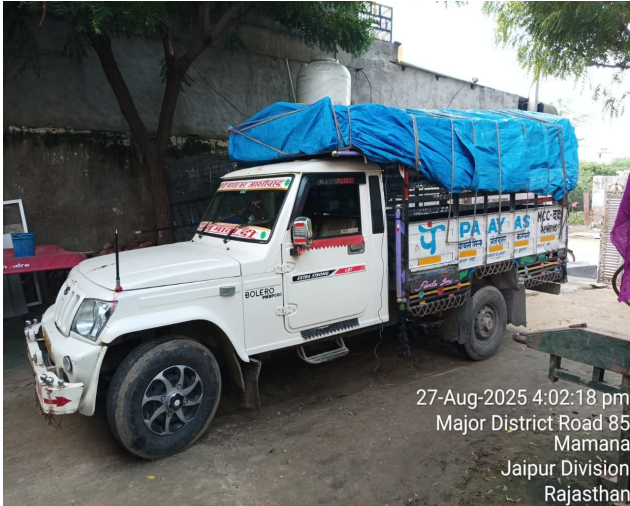
27-Aug-2025 4:02:18 pm Major District Road 85 Mamana Jaipur Division Rajasthan