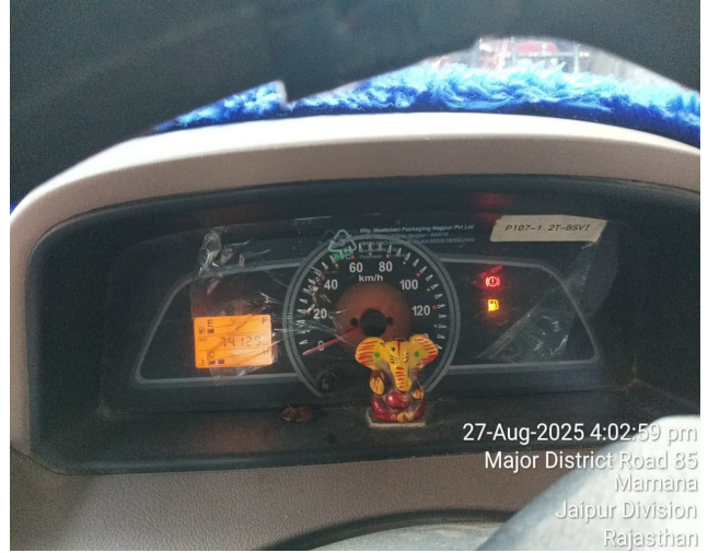
27-Aug-2025 4:02:59 pm Major District Road 85 Mamana Jaipur Division Rajasthan