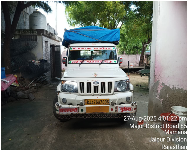
27-Aug-2025 4:01:22 pm Major District Road 85 Mamana Jaipur Division Rajasthan