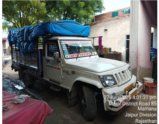
27-Aug-2025 4:01:31 pm Major District Road 85 Mamana Jaipur Division Rajasthan