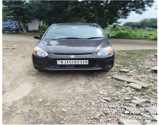
27 Aug 2025 10:49:18 am Delhi - Jaipur Expressway Harmada Jaipur Division Rajasthan