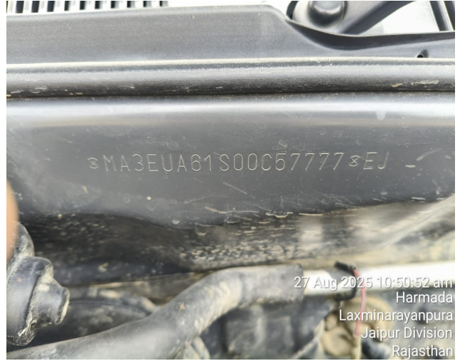
27 Aug 2025 10:50:52 am Harmada Laxminarayanpura Jaipur Division Rajasthan