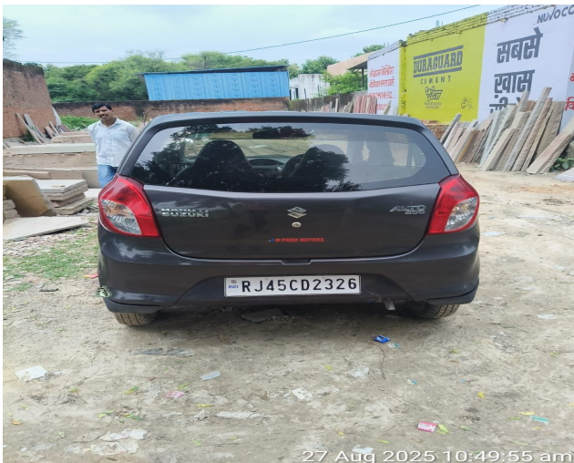
27 Aug 2025 10:49:55 am