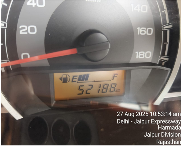
27 Aug 2025 10:53:14 am Delhi - Jaipur Expressway Harmada Jaipur Division Rajasthan

Surveyor & Loss Assessor (SLA / 65869 Valid up to 27-09-27)