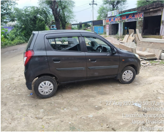
27 Aug 2025 10:50:17 am Harmada Laxminarayanpura Jaipur Division Rajasthan