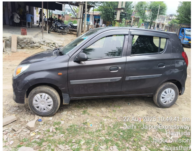
27 Aug 2025 10:49:41 am Delhi - Jaipur Expressway Harmada Jaipur Division Rajasthan