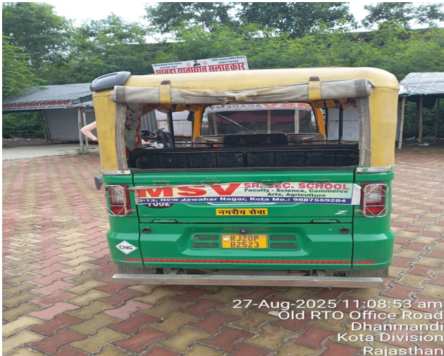
27-Aug-2025 11:08:53 am Old RTO Office Road Dhanmandi Kota Division Rajasthan