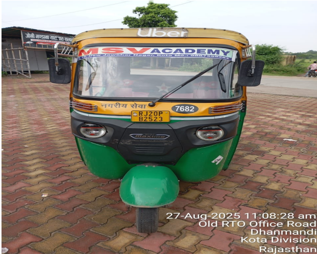
27-Aug-2025 11:08:28 am Old RTO Office Road Dhanmandi Kota Division Rajasthan