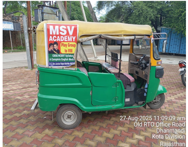
27-Aug-2025 11:09:09 am Old RTO Office Road Dhanmandi Kota Division Rajasthan