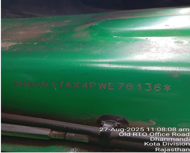
27-Aug-2025 11:08:08 am Old RTO Office Road Dhanmandi Kota Division Rajasthan

Surveyor & Loss Assessor (SLA / 65869 Valid up to 27-09-27)