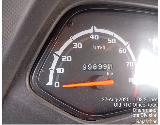
27-Aug-2025 11:08:21 am Old RTO Office Road Dhanmandi Kota Division Rajasthan