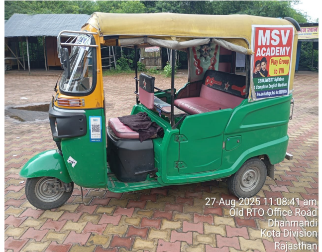
27-Aug-2025 11:08:41 am Old RTO Office Road Dhanmandi Kota Division Rajasthan