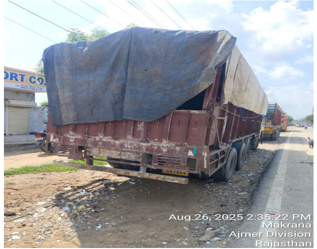
Aug 26, 2025 2:35:22 PM Makrana Ajmer Division Rajasthan