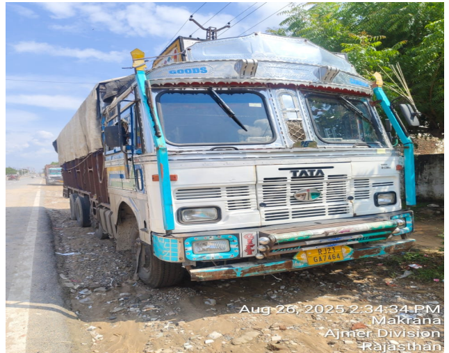
Aug 26, 2025 2:34:34 PM Makrana Ajmer Division Rajasthan