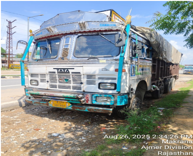
Aug 26, 2025 2:34:26 PM Makrana Ajmer Division Rajasthan