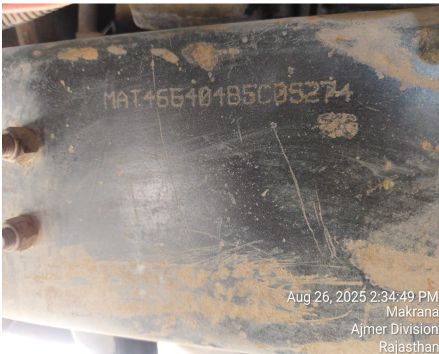
Aug 26, 2025 2:34:49 PM Makrana Ajmer Division Rajasthan