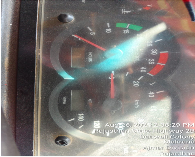
Aug 26, 2025 2:36:29 PM Rajasthan State Highway 2B Deewali Colony Makrana Ajmer Division Rajasthan

Surveyor & Loss Assessor (SLA / 65869 Valid up to 27-09-27)