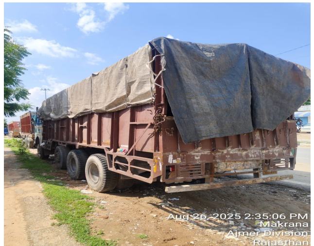
Aug 26, 2025 2:35:06 PM Makrana Ajmer Division Rajasthan