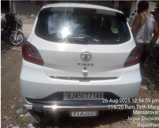
26-Aug-2025 12:54:59 pm 114/20 Ram Tirth Marg Mansarovar Jaipur Division Rajasthan