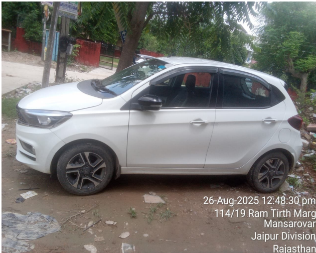
26-Aug-2025 12:48:30 pm 114/19 Ram Tirth Marg Mansarovar Jaipur Division Rajasthan