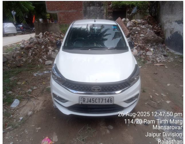
26-Aug-2025 12:47:50 pm 114/20 Ram Tirth Marg Mansarovar Jaipur Division Rajasthan