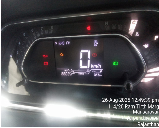
26-Aug-2025 12:49:39 pm 114/20 Ram Tirth Marg Mansarovar Jaipur Division Rajasthan

Surveyor & Loss Assessor (SLA / 65869 Valid up to 27-09-27)