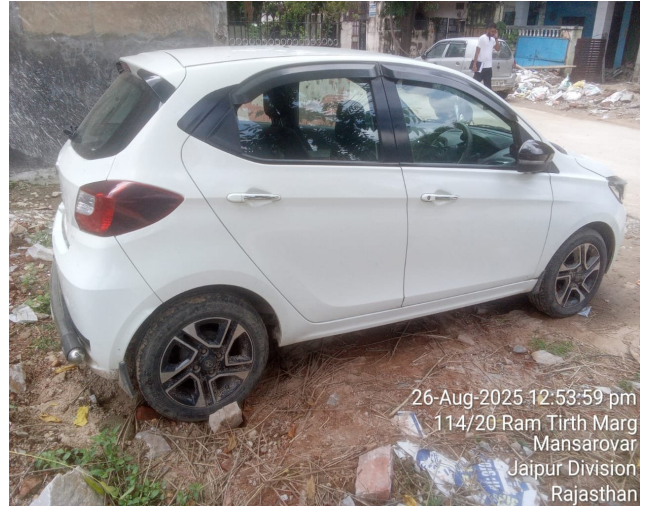
26-Aug-2025 12:53:59 pm 114/20 Ram Tirth Marg Mansarovar Jaipur Division Rajasthan