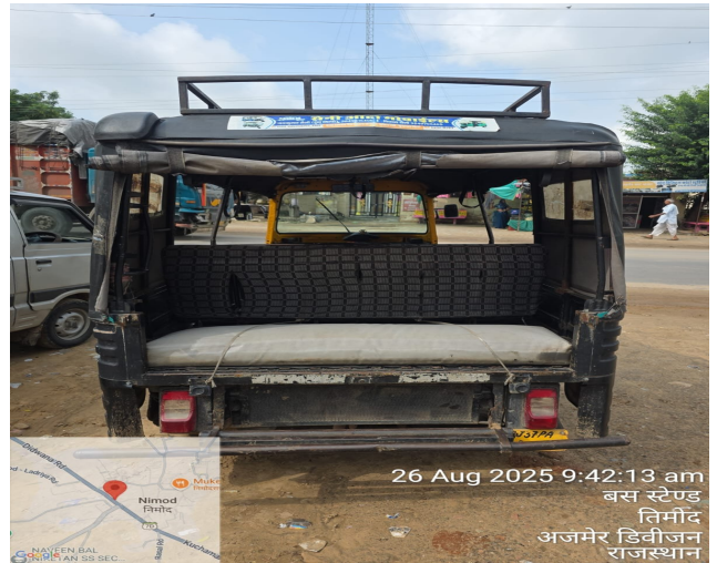
26 Aug 2025 9:42:13 am बस स्टैण्ड तिमोद अजमेर डिवीजन राजस्थान