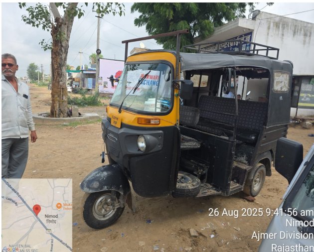
26 Aug 2025 9:41:56 am Nimod Ajmer Division Rajasthan