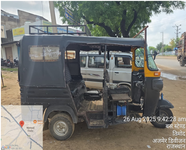
26 Aug 2025 9:42:28 am बस स्टैण्ड तिमोद अजमेर डिवीजन राजस्थान