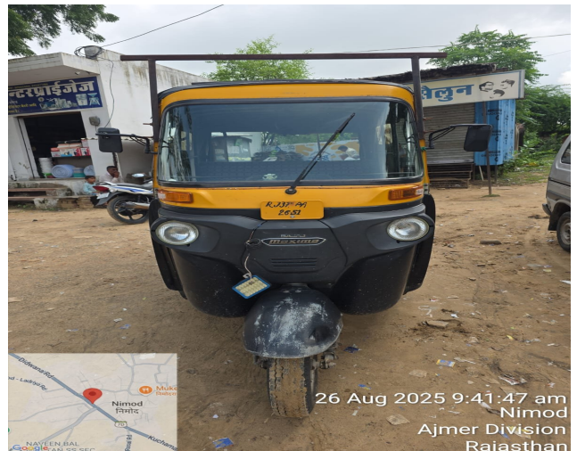
26 Aug 2025 9:41:47 am Nimod Ajmer Division Rajasthan