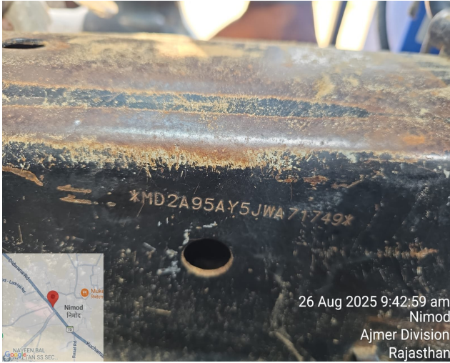
26 Aug 2025 9:42:59 am Nimod Ajmer Division Rajasthan

Surveyor & Loss Assessor (SLA / 65869 Valid up to 27-09-27)