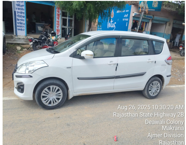
Aug 26, 2025 10:30:20 AM Rajasthan State Highway 2B Deawali Colony Makrana Ajmer Division Rajasthan