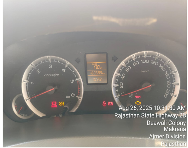
Aug 26, 2025 10:31:30 AM Rajasthan State Highway 2B Deawali Colony Makrana Ajmer Division Rajasthan