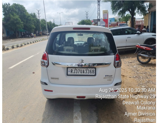
Aug 26, 2025 10:30:30 AM Rajasthan State Highway 2B Deawali Colony Makrana Ajmer Division Rajasthan