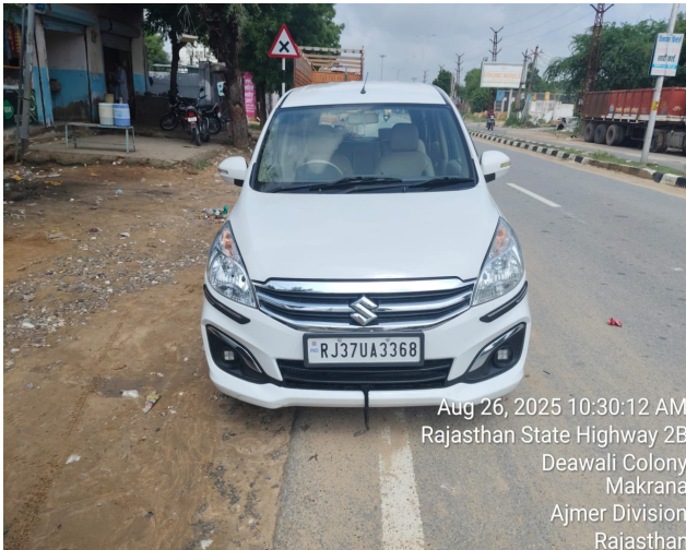
Aug 26, 2025 10:30:12 AM Rajasthan State Highway 2B Deawali Colony Makrana Ajmer Division Rajasthan