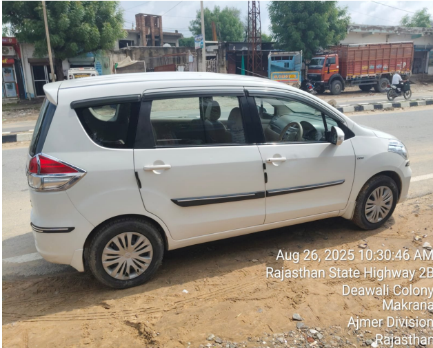
Aug 26, 2025 10:30:46 AM Rajasthan State Highway 2B Deawali Colony Makrana Ajmer Division Rajasthan