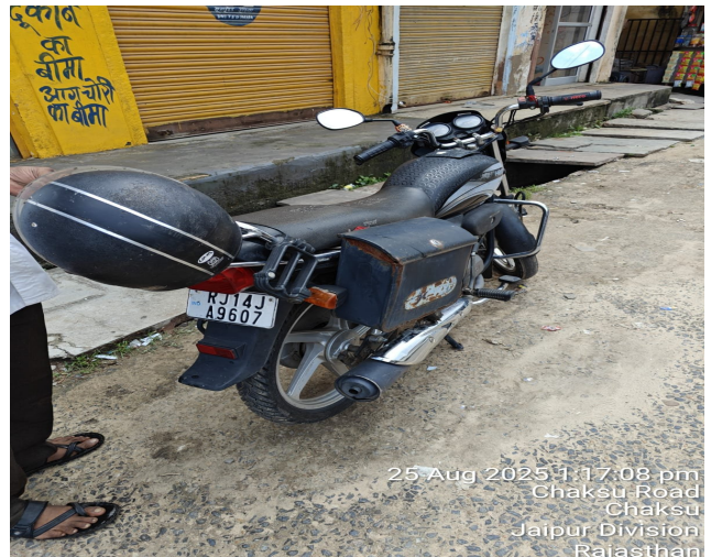
25 Aug 2025 1:17:08 pm Chaksu Road Chaksu Jaipur Division Rajasthan