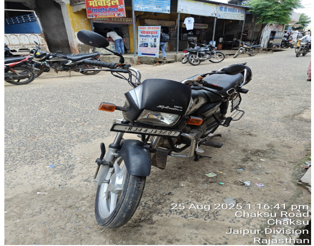
25 Aug 2025 1:16:41 pm Chaksu Road Chaksu Jaipur Division Rajasthan