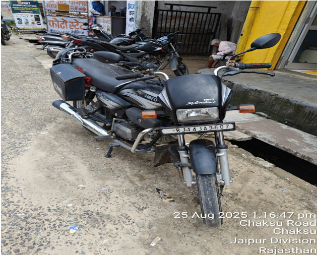
25 Aug 2025 1:16:47 pm Chaksu Road Chaksu Jaipur Division Rajasthan