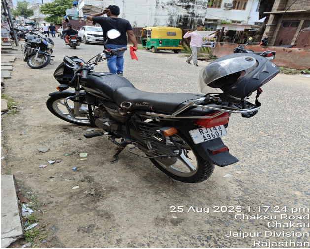
25 Aug 2025 1:17:24 pm Chaksu Road Chaksu Jaipur Division Rajasthan

Surveyor & Loss Assessor (SLA / 65869 Valid up to 27-09-27)