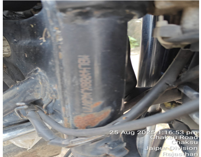
25 Aug 2025 1:16:53 pm Chaksu Road Chaksu Jaipur Division Rajasthan