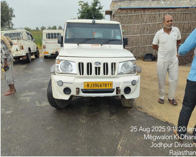
25 Aug 2025 9:11:20 am Megwalon Ki Dhani Jodhpur Division Rajasthan

Surveyor & Loss Assessor (SLA / 65869 Valid up to 27-09-27)