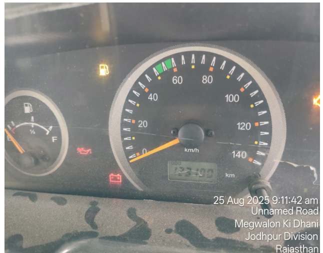
25 Aug 2025 9:11:42 am Unnamed Road Megwalon Ki Dhani Jodhpur Division Rajasthan