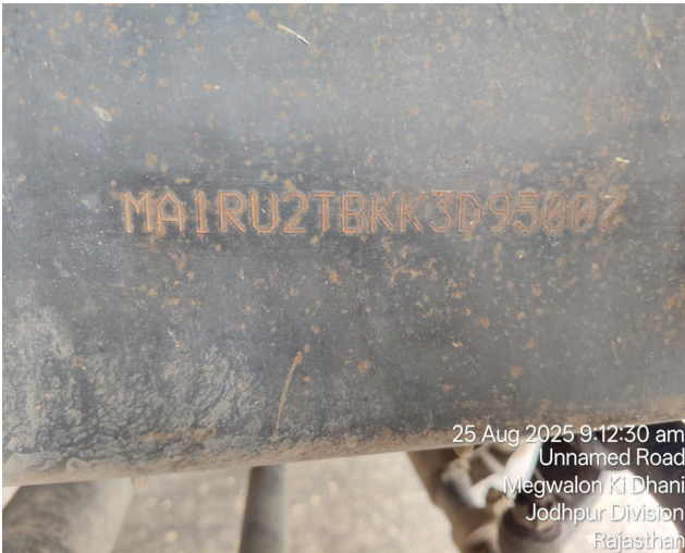
25 Aug 2025 9:12:30 am Unnamed Road Megwalon Ki Dhani Jodhpur Division Rajasthan