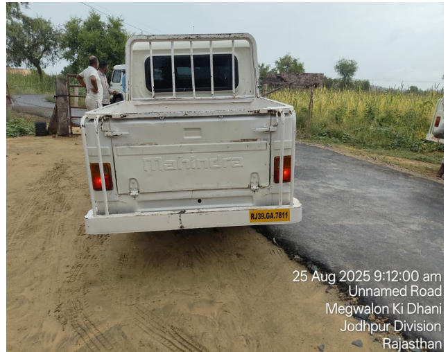
25 Aug 2025 9:12:00 am Unnamed Road Megwalon Ki Dhani Jodhpur Division Rajasthan