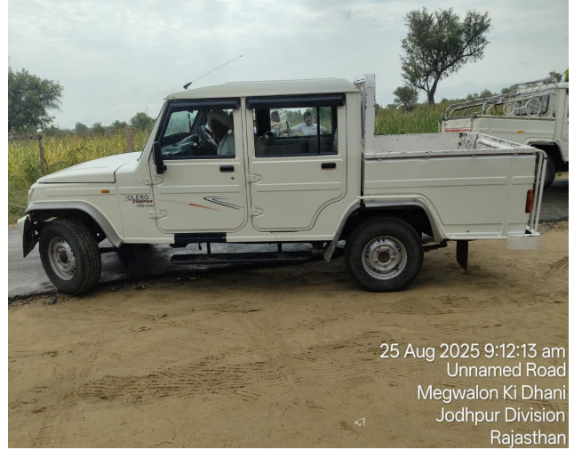
25 Aug 2025 9:12:13 am Unnamed Road Megwalon Ki Dhani Jodhpur Division Rajasthan