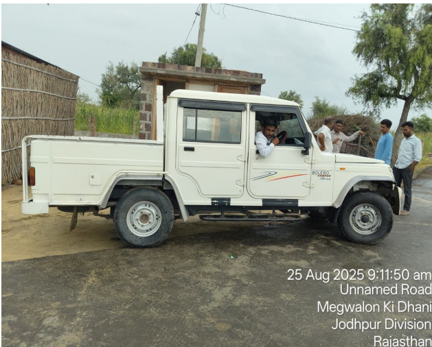
25 Aug 2025 9:11:50 am Unnamed Road Megwalon Ki Dhani Jodhpur Division Rajasthan