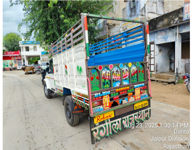
Aug 23, 2025 1:30:14 PM Danta Jaipur Division Rajasthan