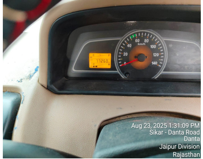
Aug 23, 2025 1:31:09 PM Sikar - Danta Road Danta Jaipur Division Rajasthan