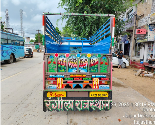
Aug 23, 2025 1:30:18 PM Danta Jaipur Division Rajasthan