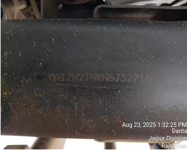
Aug 23, 2025 1:32:25 PM Danta Jaipur Division Rajasthan

Surveyor & Loss Assessor (SLA / 65869 Valid up to 27-09-27)