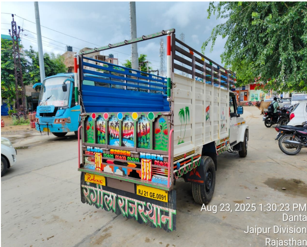
Aug 23, 2025 1:30:23 PM Danta Jaipur Division Rajasthan