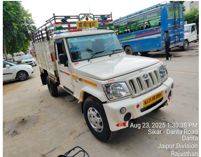
Aug 23, 2025 1:30:38 PM Sikar - Danta Road Danta Jaipur Division Rajasthan