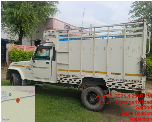
Aug 22, 2025 4:25:01 PM Jaipur - Ageetgarh Road Samod Jaipur Division Rajasthan