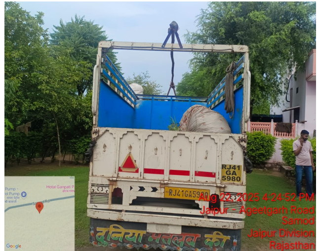
Aug 22, 2025 4:24:52 PM Jaipur - Ageetgarh Road Samod Jaipur Division Rajasthan