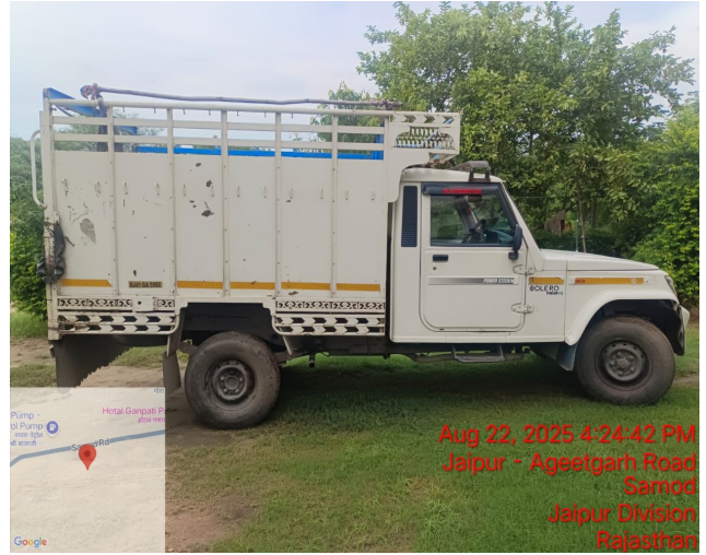
Aug 22, 2025 4:24:42 PM Jaipur - Ageetgarh Road Samod Jaipur Division Rajasthan