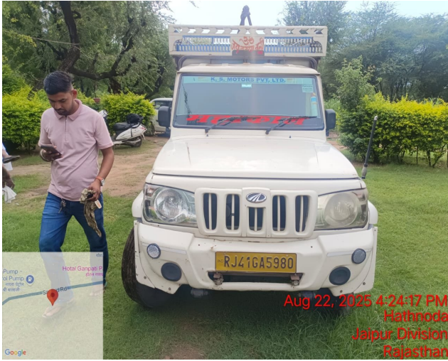
Aug 22, 2025 4:24:17 PM Hathnoda Jaipur Division Rajasthan

Surveyor & Loss Assessor (SLA / 65869 Valid up to 27-09-27)