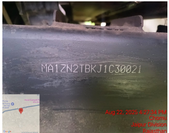
Aug 22, 2025 4:27:34 PM Chomu Jaipur Division Rajasthan