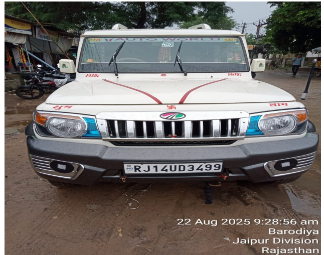
22 Aug 2025 9:28:56 am Barodiya Jaipur Division Rajasthan