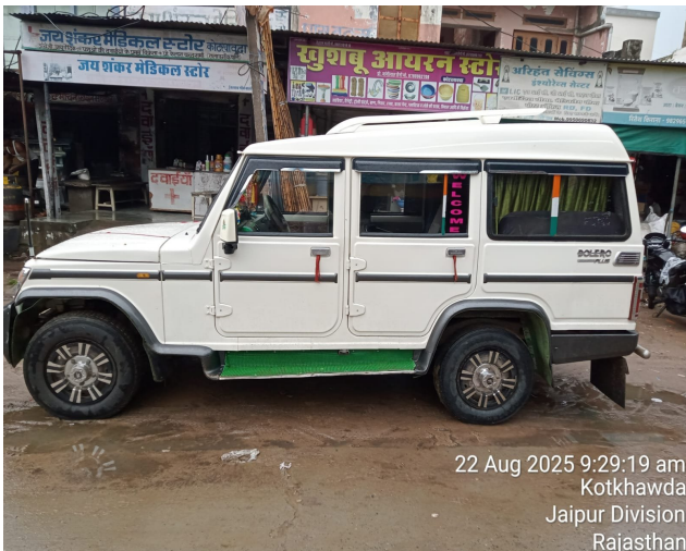
22 Aug 2025 9:29:19 am Kotkhawda Jaipur Division Rajasthan