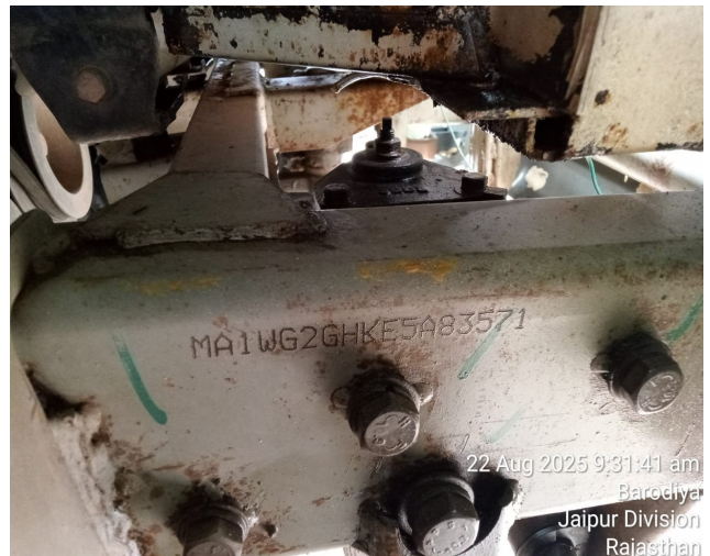
22 Aug 2025 9:31:41 am Barodiya Jaipur Division Rajasthan