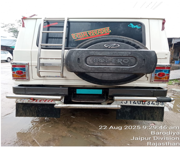
22 Aug 2025 9:29:46 am Barodiya Jaipur Division Rajasthan

Surveyor & Loss Assessor (SLA / 65869 Valid up to 27-09-27)