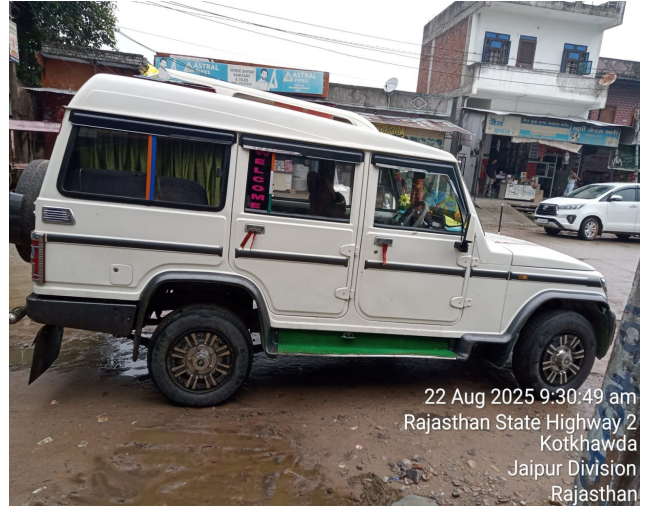
22 Aug 2025 9:30:49 am Rajasthan State Highway 2 Kotkhawda Jaipur Division Rajasthan