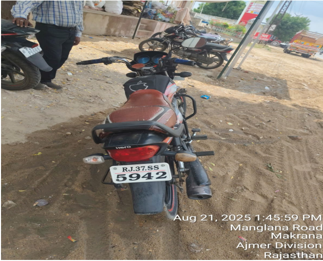
Aug 21, 2025 1:45:59 PM Manglana Road Makrana Ajmer Division Rajasthan

Surveyor & Loss Assessor (SLA / 65869 Valid up to 27-09-27)