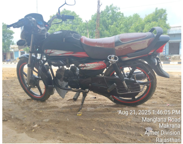
Aug 21, 2025 1:46:05 PM Manglana Road Makrana Ajmer Division Rajasthan