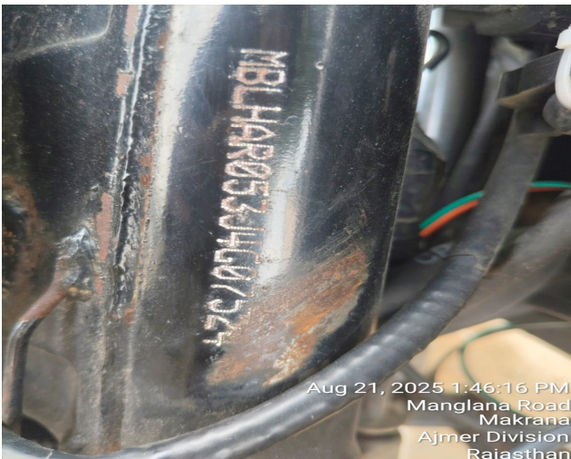
Aug 21, 2025 1:46:16 PM Manglana Road Makrana Ajmer Division Rajasthan