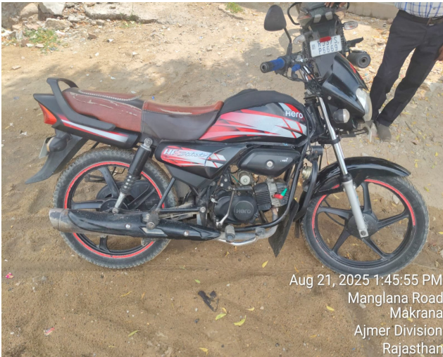
Aug 21, 2025 1:45:55 PM Manglana Road Makrana Ajmer Division Rajasthan