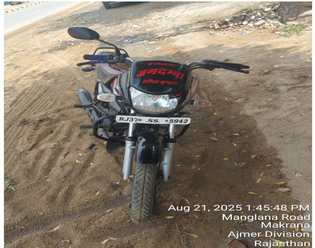
Aug 21, 2025 1:45:48 PM Manglana Road Makrana Ajmer Division Rajasthan