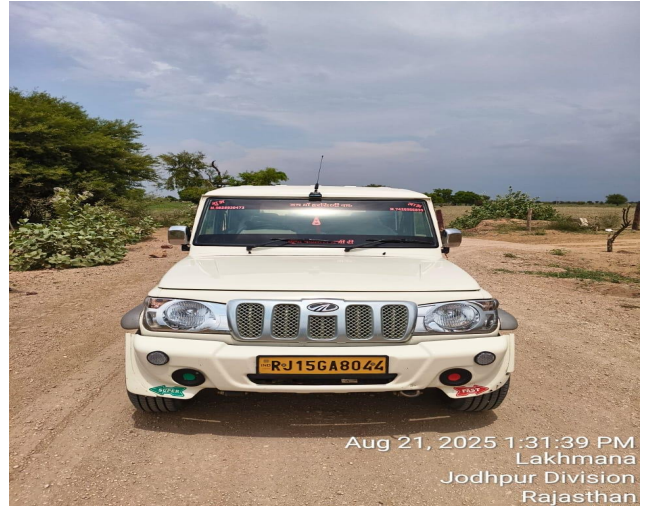
Aug 21, 2025 1:31:39 PM Lakhmana Jodhpur Division Rajasthan