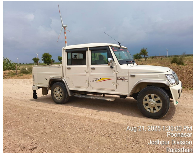
Aug 21, 2025 1:30:00 PM Poonasar Jodhpur Division Rajasthan