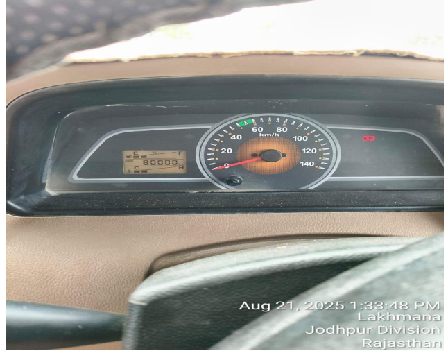
Aug 21, 2025 1:33:48 PM Lakhmana Jodhpur Division Rajasthan