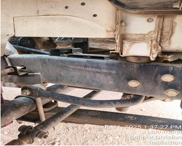
Aug 21, 2025 1:37:27 PM Lakhmana Jodhpur Division Rajasthan

Surveyor & Loss Assessor (SLA / 65869 Valid up to 27-09-27)