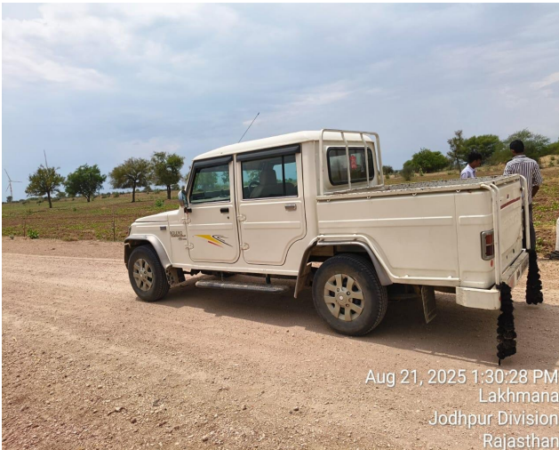
Aug 21, 2025 1:30:28 PM Lakhmana Jodhpur Division Rajasthan