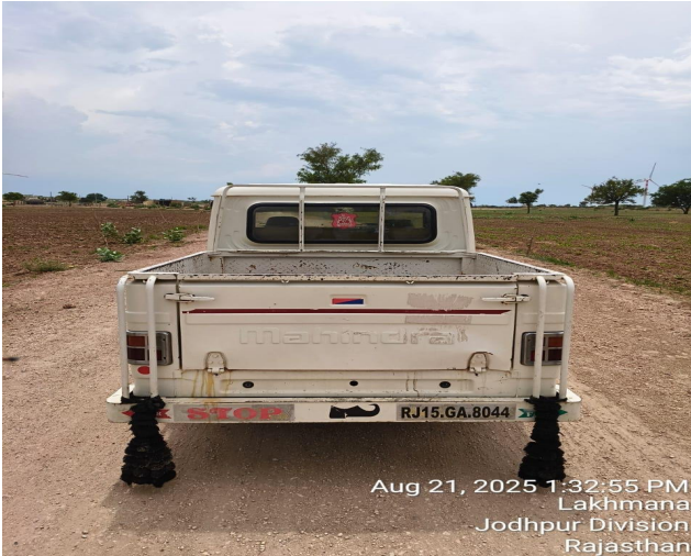
Aug 21, 2025 1:32:55 PM Lakhmana Jodhpur Division Rajasthan