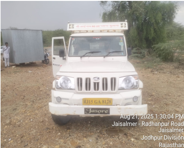
Aug 21, 2025 1:30:04 PM Jaisalmer - Radhanpur Road Jaisalmer Jodhpur Division Rajasthan