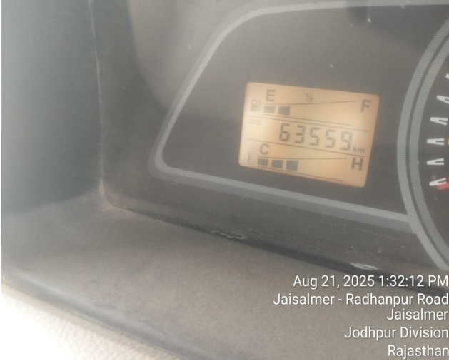
Aug 21, 2025 1:32:12 PM Jaisalmer - Radhanpur Road Jaisalmer Jodhpur Division Rajasthan

Surveyor & Loss Assessor (SLA / 65869 Valid up to 27-09-27)