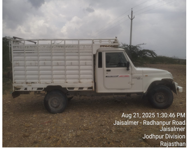
Aug 21, 2025 1:30:46 PM Jaisalmer - Radhanpur Road Jaisalmer Jodhpur Division Rajasthan