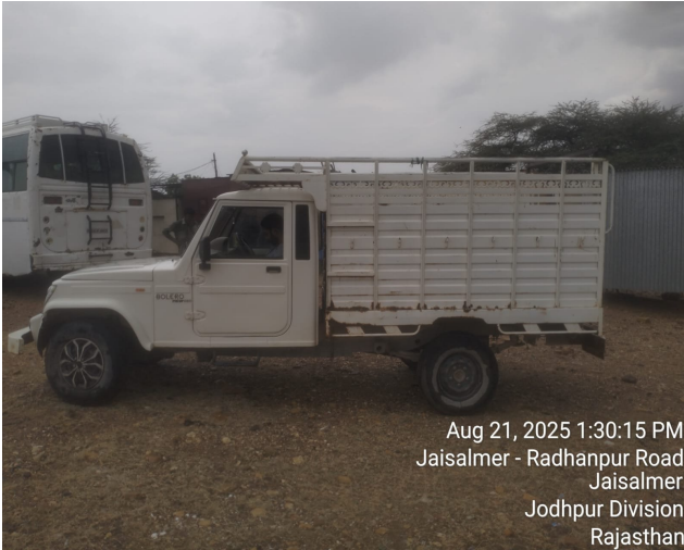
Aug 21, 2025 1:30:15 PM Jaisalmer - Radhanpur Road Jaisalmer Jodhpur Division Rajasthan