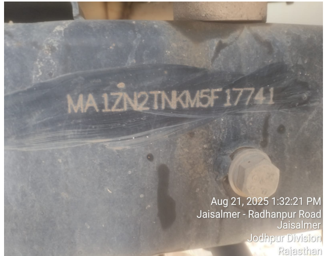
Aug 21, 2025 1:32:21 PM Jaisalmer - Radhanpur Road Jaisalmer Jodhpur Division Rajasthan