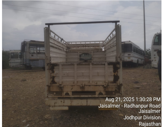
Aug 21, 2025 1:30:28 PM Jaisalmer - Radhanpur Road Jaisalmer Jodhpur Division Rajasthan