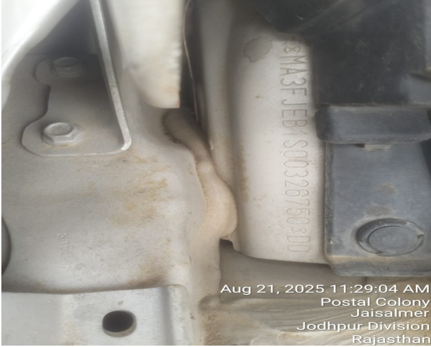
Aug 21, 2025 11:29:04 AM Postal Colony Jaisalmer Jodhpur Division Rajasthan

Surveyor & Loss Assessor (SLA / 65869 Valid up to 27-09-27)