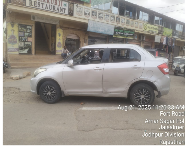
Aug 21, 2025 11:26:33 AM Fort Road Amar Sagar Pol Jaisalmer Jodhpur Division Rajasthan