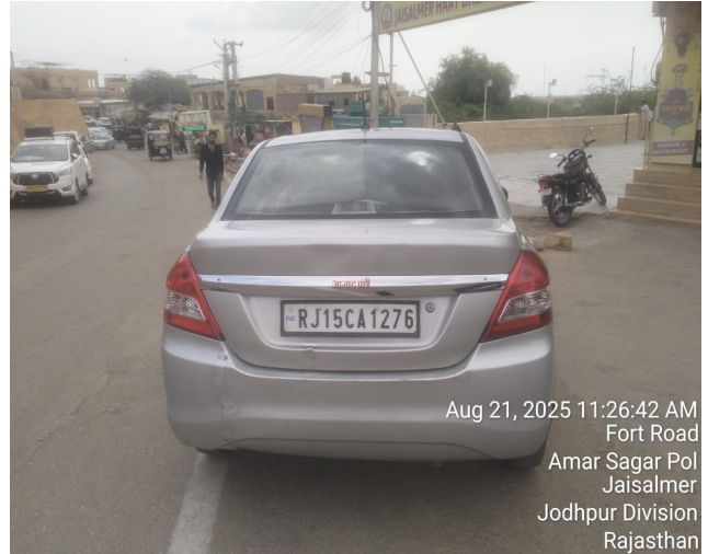
Aug 21, 2025 11:26:42 AM Fort Road Amar Sagar Pol Jaisalmer Jodhpur Division Rajasthan