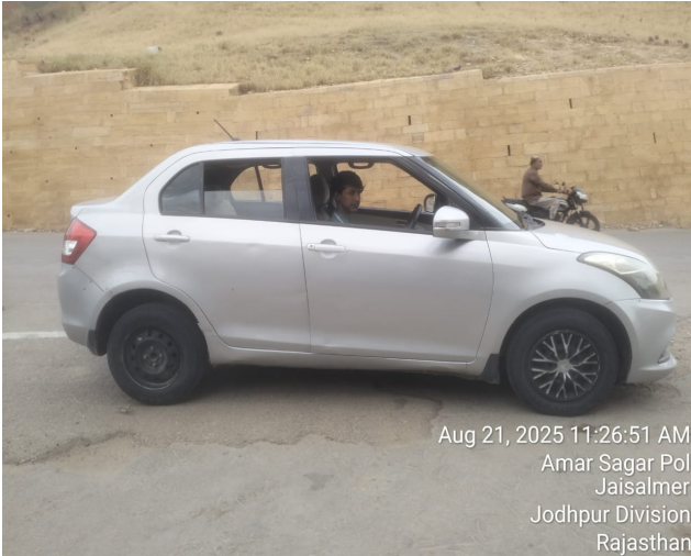
Aug 21, 2025 11:26:51 AM Amar Sagar Pol Jaisalmer Jodhpur Division Rajasthan