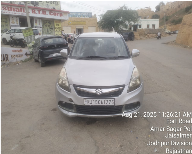
Aug 21, 2025 11:26:21 AM Fort Road Amar Sagar Pol Jaisalmer Jodhpur Division Rajasthan