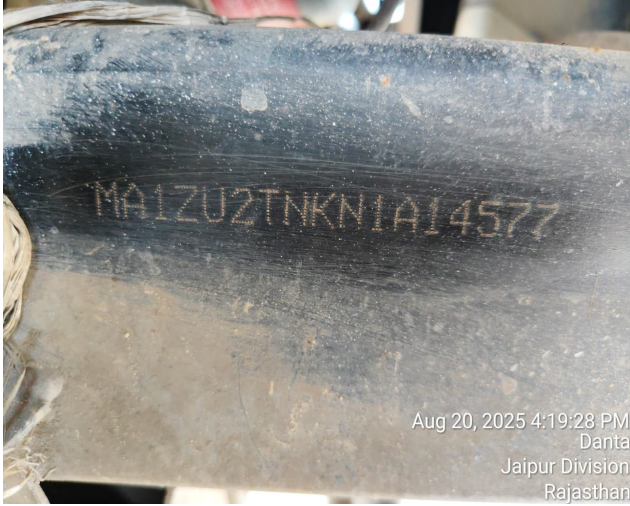
Aug 20, 2025 4:19:28 PM Danta Jaipur Division Rajasthan

Surveyor & Loss Assessor (SLA / 65869 Valid up to 27-09-27)