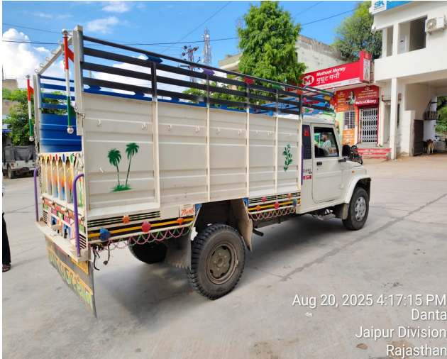
Aug 20, 2025 4:17:15 PM Danta Jaipur Division Rajasthan