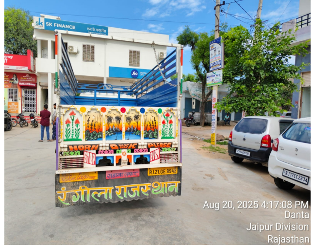
Aug 20, 2025 4:17:08 PM Danta Jaipur Division Rajasthan