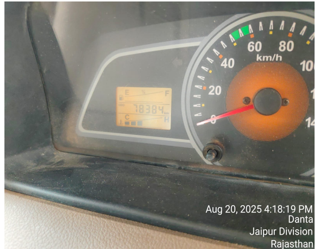
Aug 20, 2025 4:18:19 PM Danta Jaipur Division Rajasthan