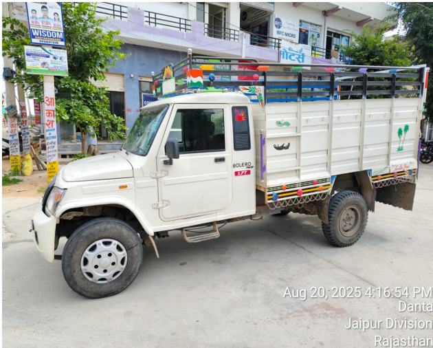
Aug 20, 2025 4:16:54 PM Danta Jaipur Division Rajasthan