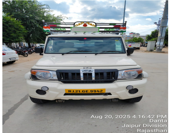
Aug 20, 2025 4:16:42 PM Danta Jaipur Division Rajasthan