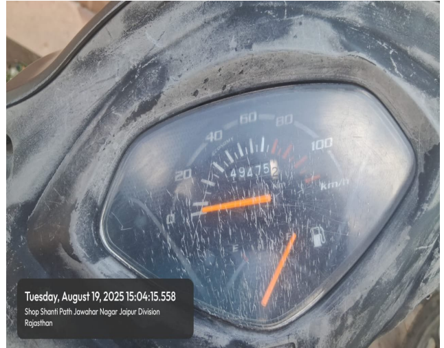
Tuesday, August 19, 2025 15:04:15.558 Shop Shanti Path Jawahar Nagar Jaipur Division Rajasthan