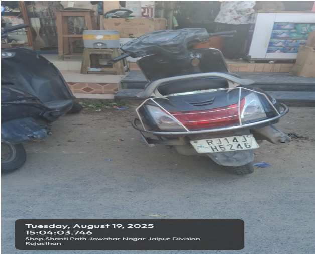
Tuesday, August 19, 2025 15:04:03.746 Shop Shanti Path Jawahar Nagar Jaipur Division Rajasthan