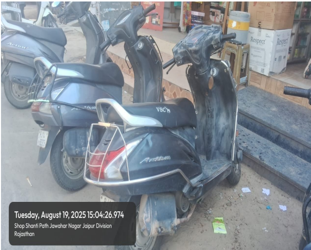
Tuesday, August 19, 2025 15:04:26.974 Shop Shanti Path Jawahar Nagar Jaipur Division Rajasthan