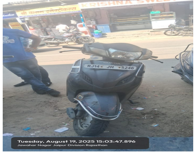
Tuesday, August 19, 2025 15:03:47.896 Jawahar Nagar Jaipur Division Rajasthan