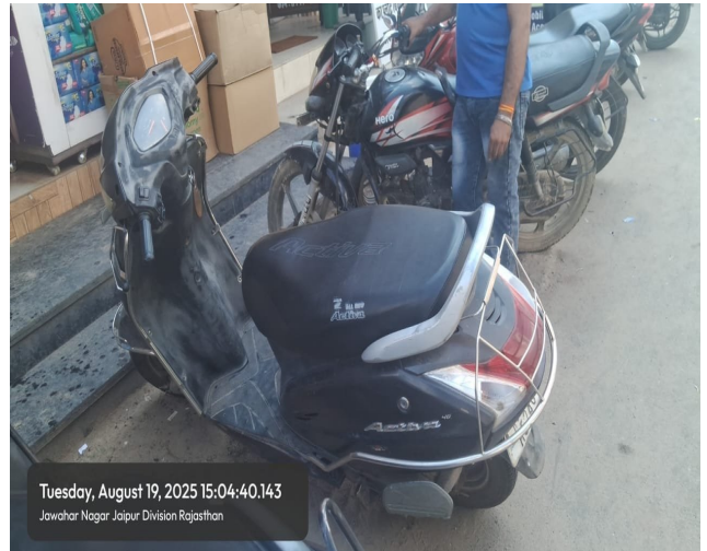
Tuesday, August 19, 2025 15:04:40.143 Jawahar Nagar Jaipur Division Rajasthan