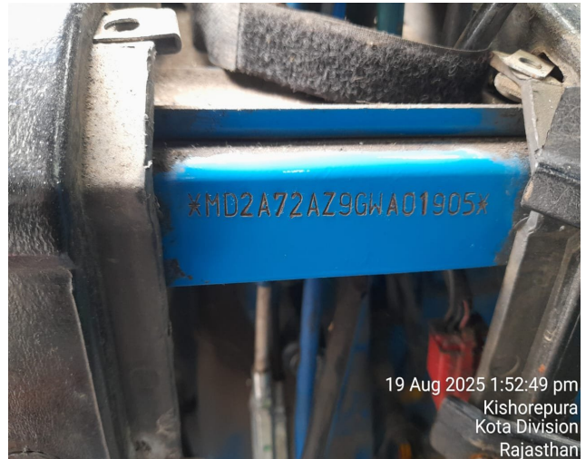
19 Aug 2025 1:52:49 pm Kishorepura Kota Division Rajasthan