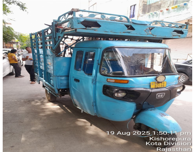
19 Aug 2025 1:50:11 pm Kishorepura Kota Division Rajasthan