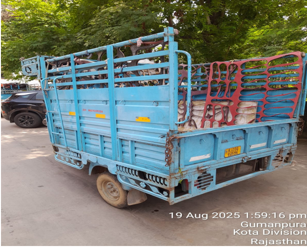
19 Aug 2025 1:59:16 pm Gumanpura Kota Division Rajasthan

Surveyor & Loss Assessor (SLA / 65869 Valid up to 27-09-27)