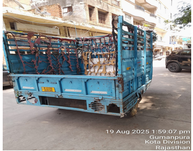
19 Aug 2025 1:59:07 pm Gumanpura Kota Division Rajasthan