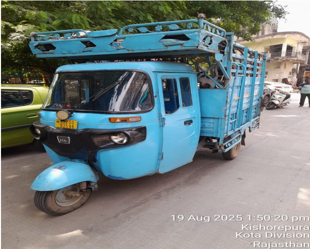
19 Aug 2025 1:50:20 pm Kishorepura Kota Division Rajasthan