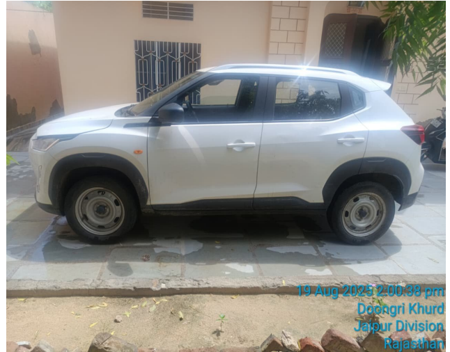
19 Aug 2025 2:00:38 pm Doongri Khurd Jaipur Division Rajasthan