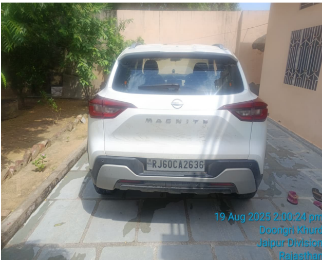
19 Aug 2025 2:00:24 pm Doongri Khurd Jaipur Division Rajasthan