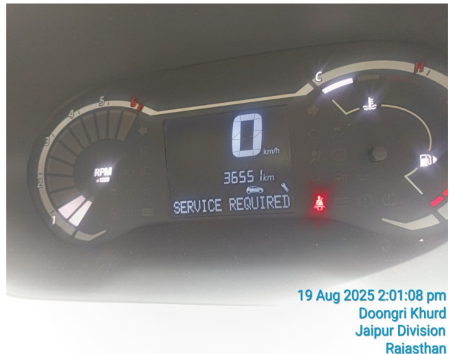
19 Aug 2025 2:01:08 pm Doongri Khurd Jaipur Division Rajasthan