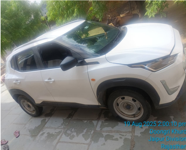
19 Aug 2025 2:00:10 pm Doongri Khurd Jaipur Division Rajasthan