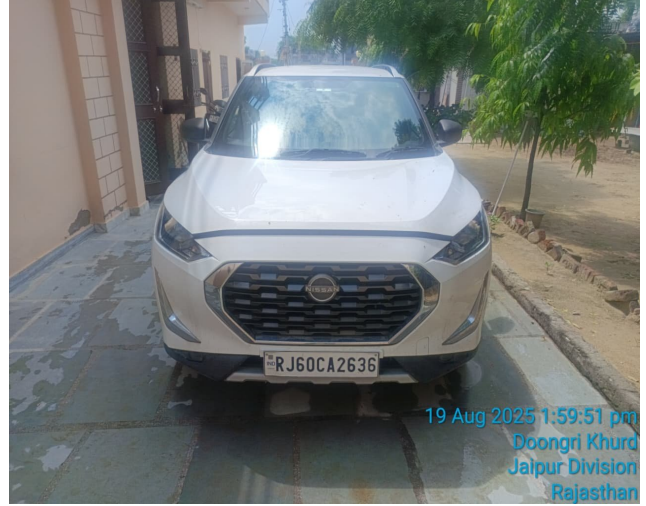
19 Aug 2025 1:59:51 pm Doongri Khurd Jaipur Division Rajasthan