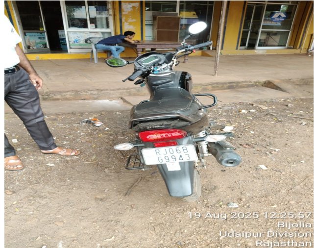
19 Aug 2025 12:25:57 Bijolia Udaipur Division Rajasthan