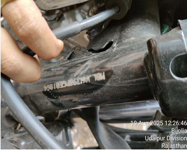
19 Aug 2025 12:26:46 Bijolia Udaipur Division Rajasthan

Surveyor & Loss Assessor (SLA / 65869 Valid up to 27-09-27)