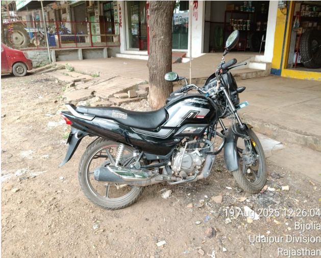
19 Aug 2025 12:26:04 Bijolia Udaipur Division Rajasthan