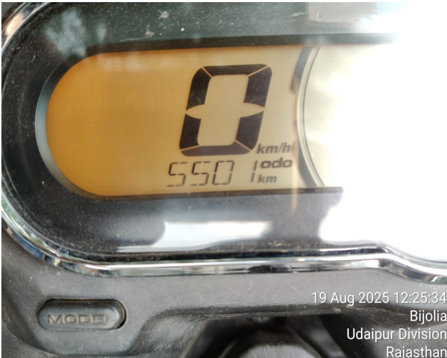
19 Aug 2025 12:25:34 Bijolia Udaipur Division Rajasthan