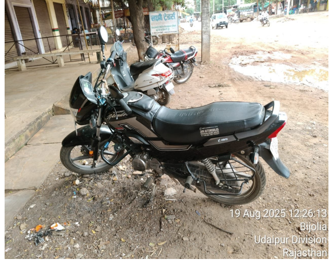
19 Aug 2025 12:26:13 Bijolia Udaipur Division Rajasthan