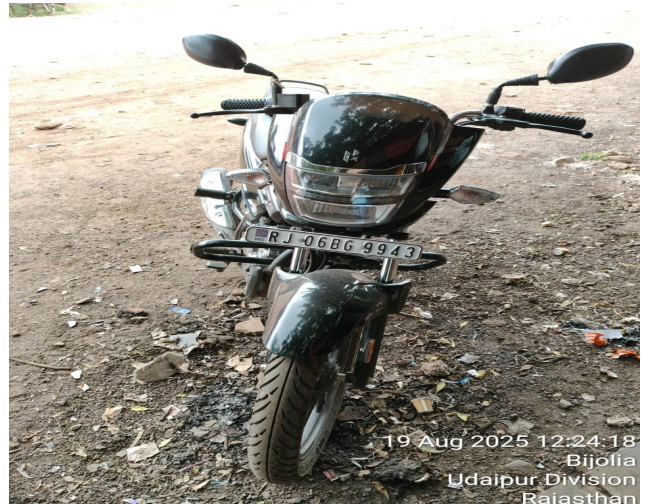
19 Aug 2025 12:24:18 Bijolia Udaipur Division Rajasthan