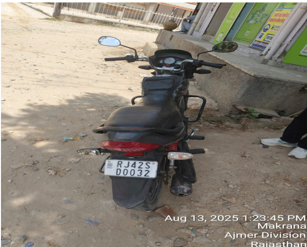
Aug 13, 2025 1:23:45 PM Makrana Ajmer Division Rajasthan