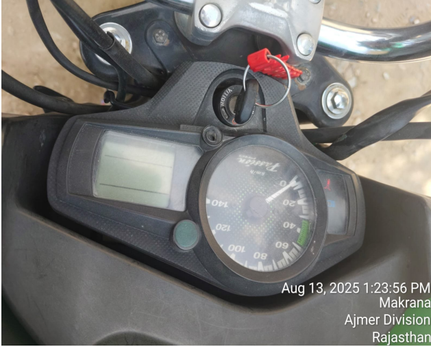
Aug 13, 2025 1:23:56 PM Makrana Ajmer Division Rajasthan

Surveyor & Loss Assessor (SLA / 65869 Valid up to 27-09-27)