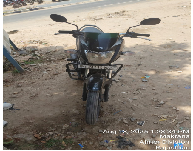
Aug 13, 2025 1:23:34 PM Makrana Ajmer Division Rajasthan