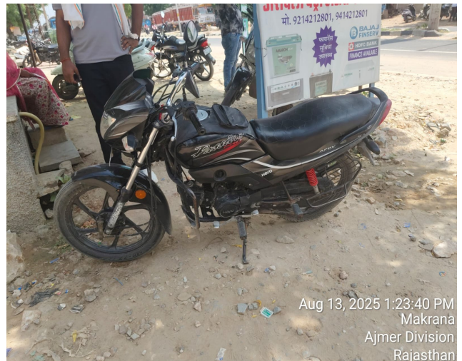
Aug 13, 2025 1:23:40 PM Makrana Ajmer Division Rajasthan