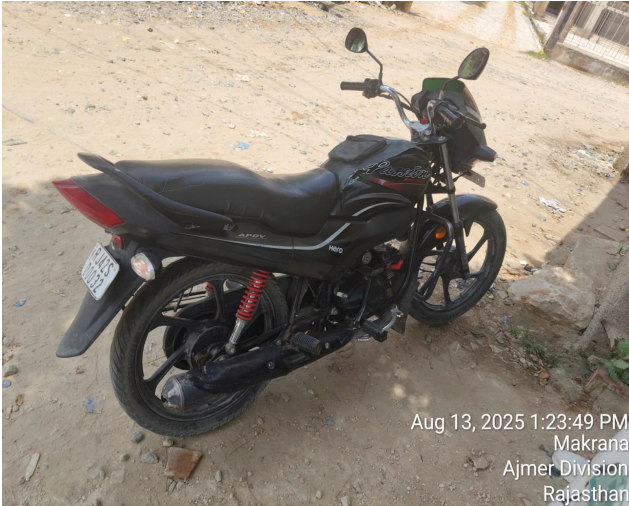
Aug 13, 2025 1:23:49 PM Makrana Ajmer Division Rajasthan