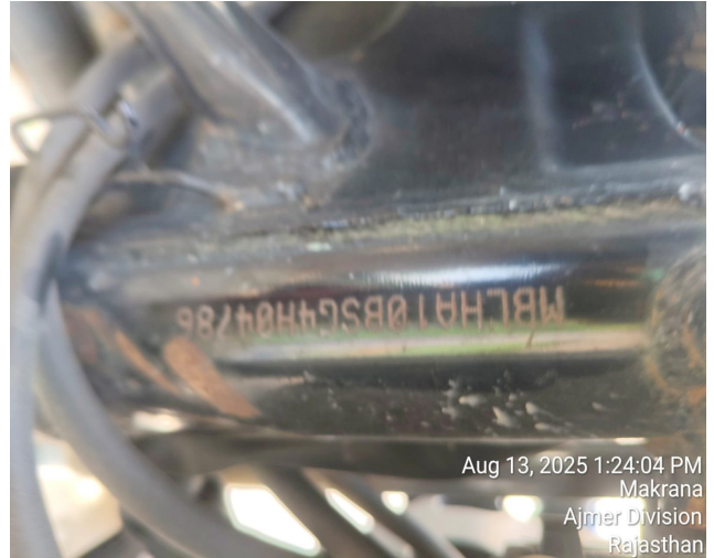
Aug 13, 2025 1:24:04 PM Makrana Ajmer Division Rajasthan