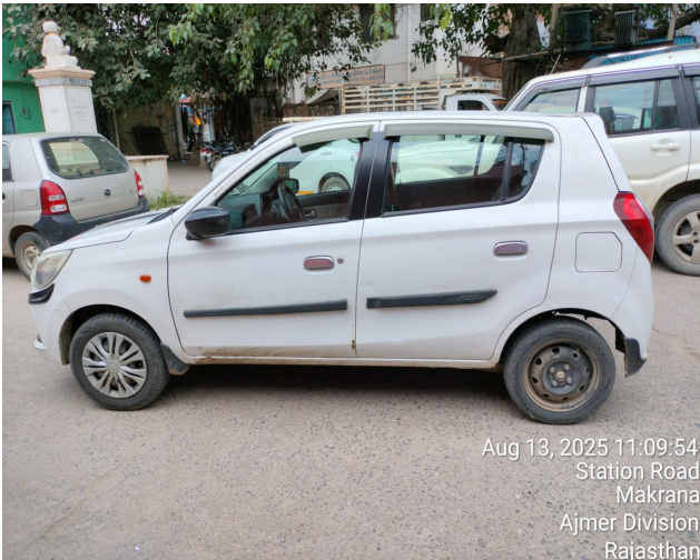
Aug 13, 2025 11:09:54 Station Road Makrana Ajmer Division Rajasthan