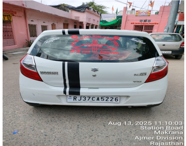
Aug 13, 2025 11:10:03 Station Road Makrana Ajmer Division Rajasthan