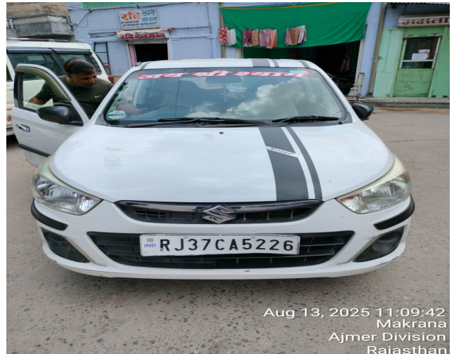
Aug 13, 2025 11:09:42 Makrana Ajmer Division Rajasthan