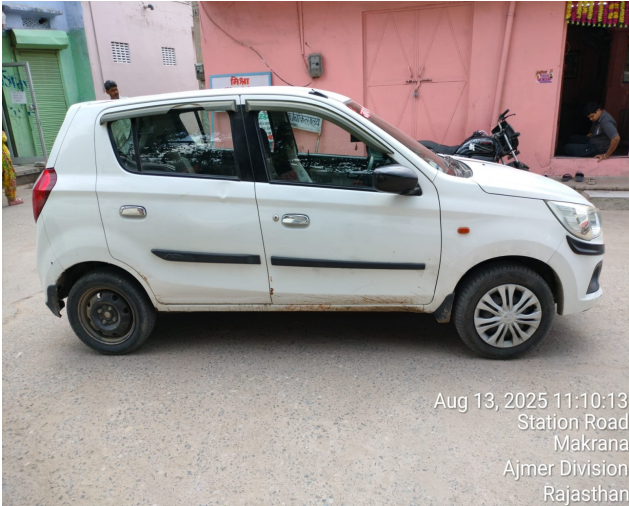
Aug 13, 2025 11:10:13 Station Road Makrana Ajmer Division Rajasthan