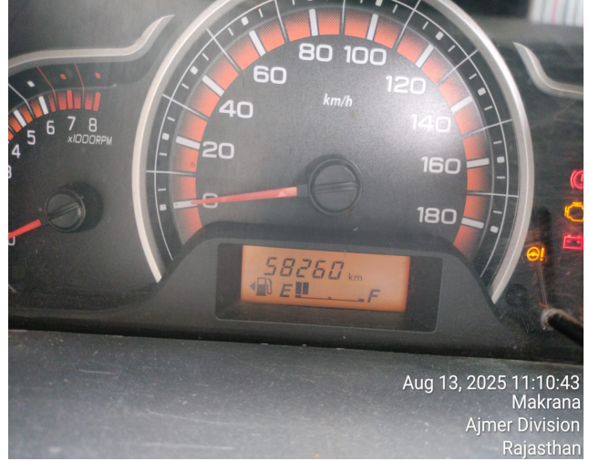
Aug 13, 2025 11:10:43 Makrana Ajmer Division Rajasthan