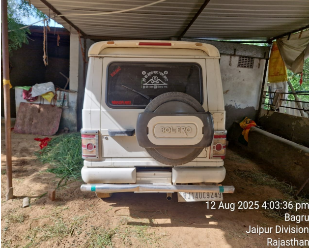
12 Aug 2025 4:03:36 pm Bagru Jaipur Division Rajasthan

Surveyor & Loss Assessor (SLA / 65869 Valid up to 27-09-27)