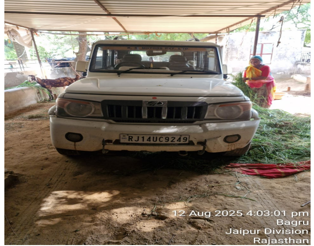
12 Aug 2025 4:03:01 pm Bagru Jaipur Division Rajasthan