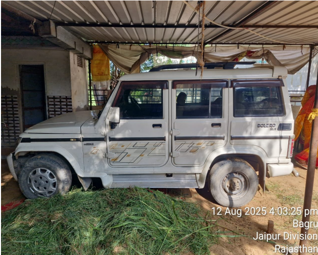
12 Aug 2025 4:03:25 pm Bagru Jaipur Division Rajasthan