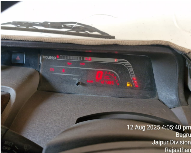
12 Aug 2025 4:05:40 pm Bagru Jaipur Division Rajasthan