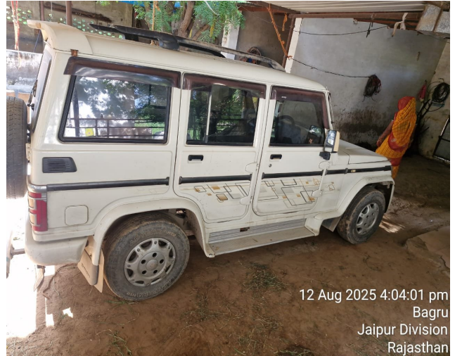
12 Aug 2025 4:04:01 pm Bagru Jaipur Division Rajasthan