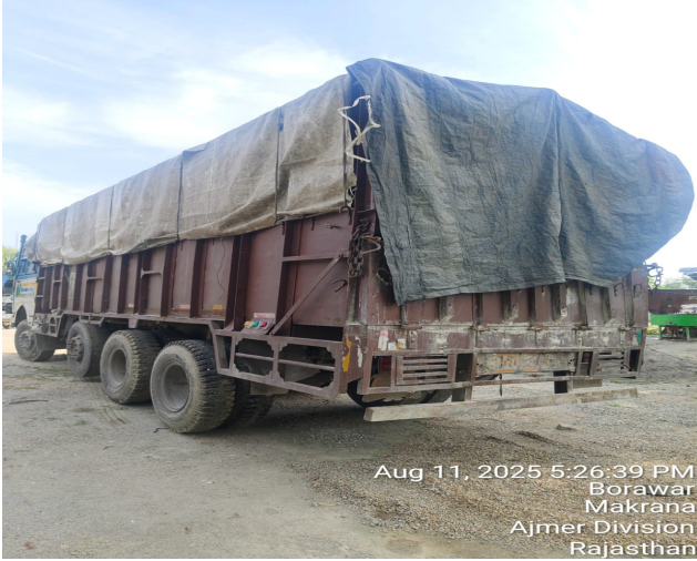
Aug 11, 2025 5:26:39 PM Borawar Makrana Ajmer Division Rajasthan

Surveyor & Loss Assessor (SLA / 65869 Valid up to 27-09-27)