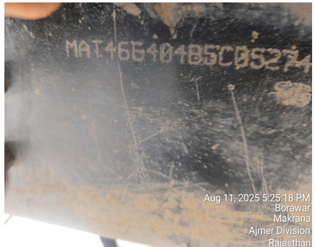
Aug 11, 2025 5:25:18 PM Borawar Makrana Ajmer Division Rajasthan