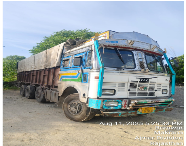
Aug 11, 2025 5:25:33 PM Borawar Makrana Ajmer Division Rajasthan