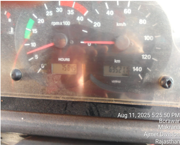
Aug 11, 2025 5:25:50 PM Borawar Makrana Ajmer Division Rajasthan