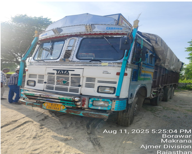
Aug 11, 2025 5:25:04 PM Borawar Makrana Ajmer Division Rajasthan