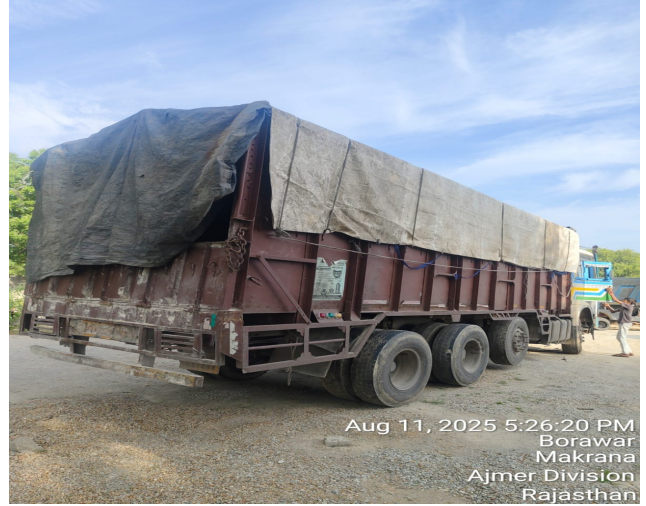
Aug 11, 2025 5:26:20 PM Borawar Makrana Ajmer Division Rajasthan