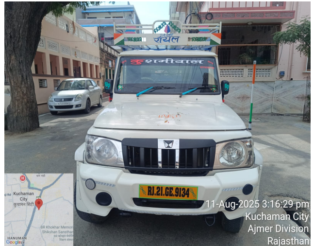
11-Aug-2025 3:16:29 pm Kuchaman City Ajmer Division Rajasthan