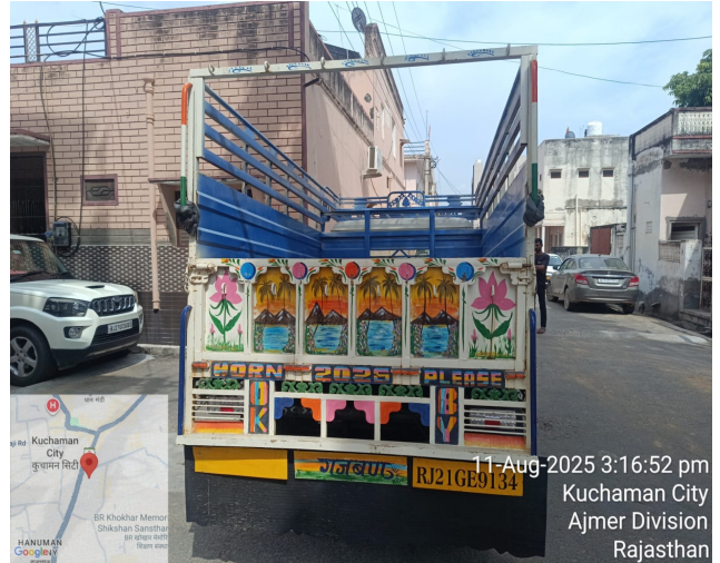
11-Aug-2025 3:16:52 pm Kuchaman City Ajmer Division Rajasthan