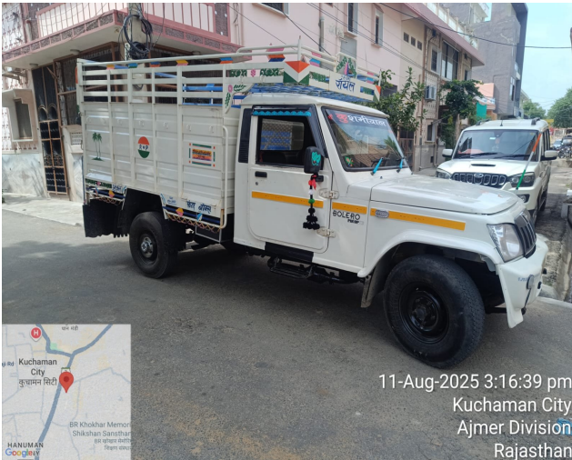
11-Aug-2025 3:16:39 pm Kuchaman City Ajmer Division Rajasthan