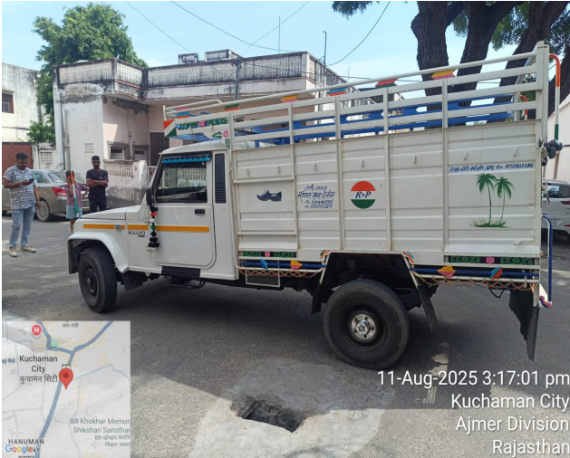
11-Aug-2025 3:17:01 pm Kuchaman City Ajmer Division Rajasthan