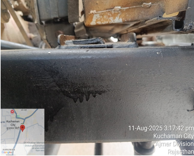
11-Aug-2025 3:17:42 pm Kuchaman City Ajmer Division Rajasthan

Surveyor & Loss Assessor (SLA / 65869 Valid up to 27-09-27)