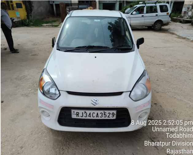
8 Aug 2025 2:52:05 pm Unnamed Road Todabhim Bharatpur Division Rajasthan