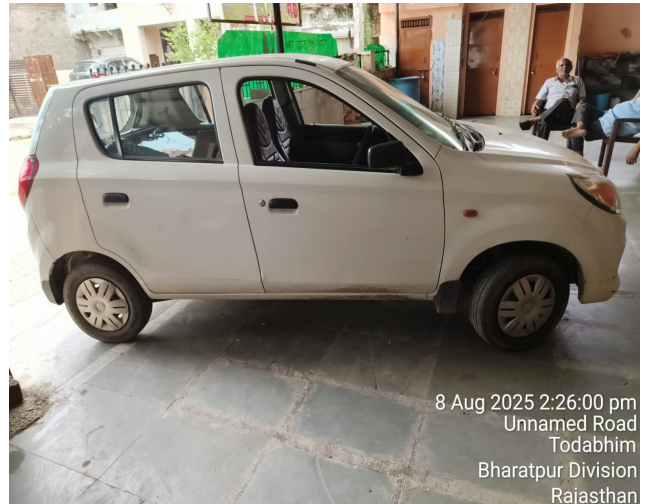
8 Aug 2025 2:26:00 pm Unnamed Road Todabhim Bharatpur Division Rajasthan