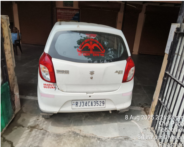
8 Aug 2025 2:26:34 pm Khel Pada Todabhim Bharatpur Division Rajasthan