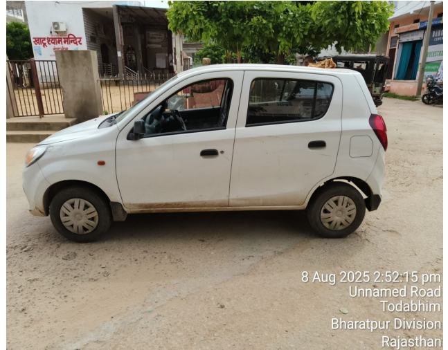
8 Aug 2025 2:52:15 pm Unnamed Road Todabhim Bharatpur Division Rajasthan