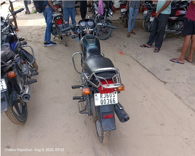
Chaksu Rajasthan Aug 8, 2025, 09:23