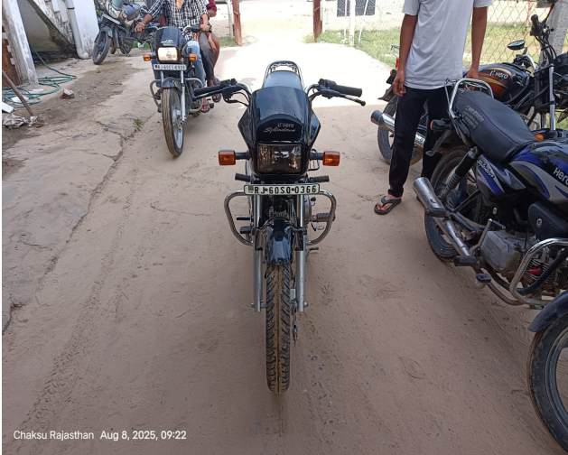
Chaksu Rajasthan Aug 8, 2025, 09:22

Surveyor & Loss Assessor (SLA / 65869 Valid up to 27-09-27)