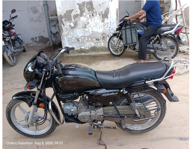
Chaksu Rajasthan Aug 8, 2025, 09:23