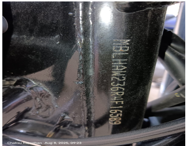
Chaksu Rajasthan Aug 8, 2025, 09:23