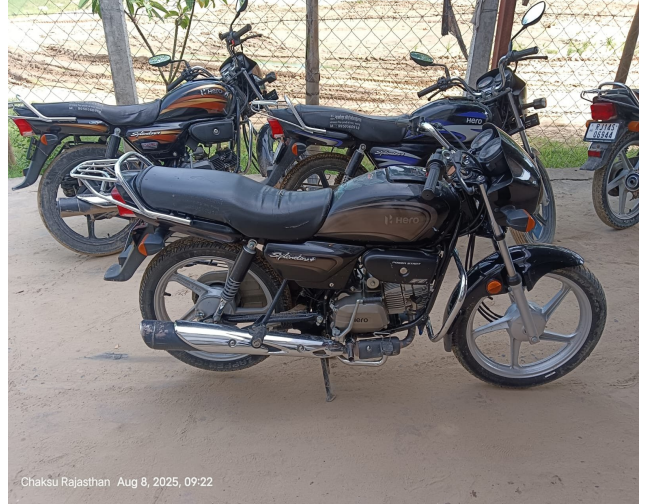
Chaksu Rajasthan Aug 8, 2025, 09:22