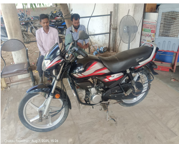
Chaksu Rajasthan Aug 7, 2025, 15:26