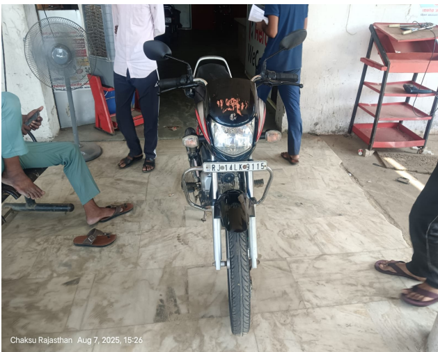
Chaksu Rajasthan Aug 7, 2025, 15:26