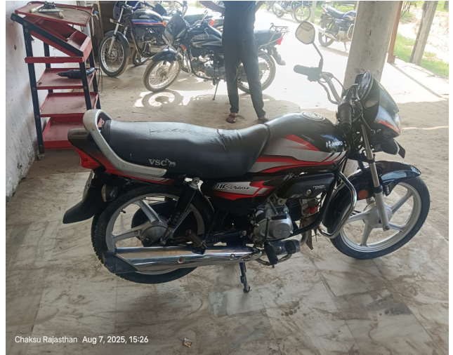
Chaksu Rajasthan Aug 7, 2025, 15:26