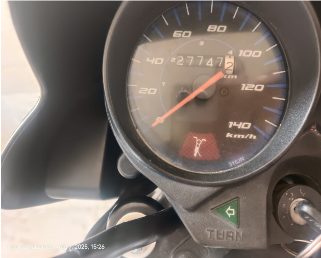
Chaksu Rajasthan Aug 7, 2025, 15:26

Surveyor & Loss Assessor (SLA / 65869 Valid up to 27-09-27)