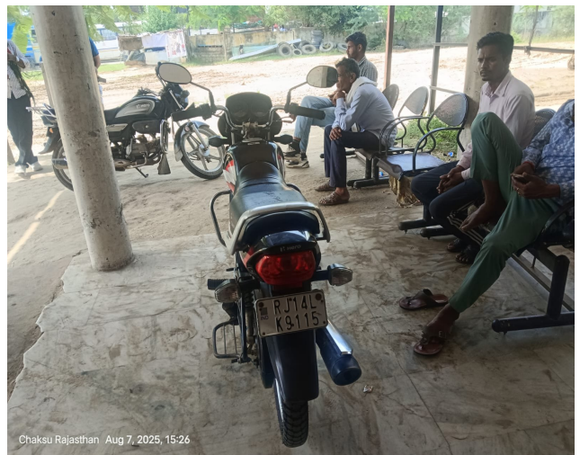
Chaksu Rajasthan Aug 7, 2025, 15:26