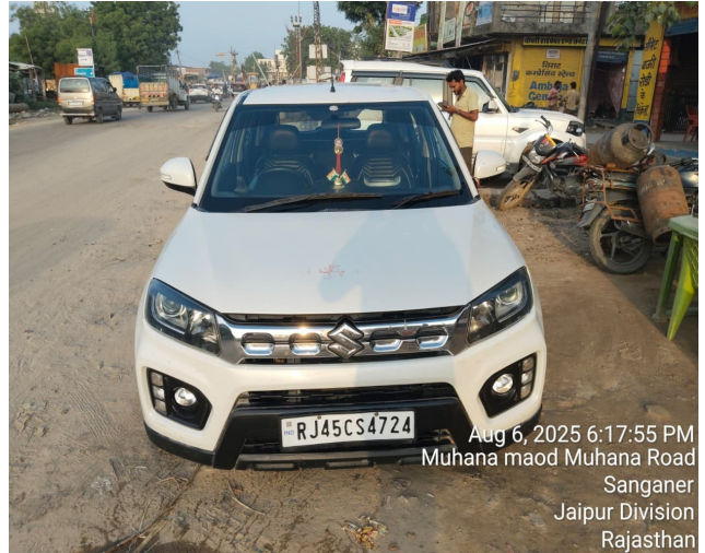
Aug 6, 2025 6:17:55 PM Muhana maod Muhana Road Sanganer Jaipur Division Rajasthan