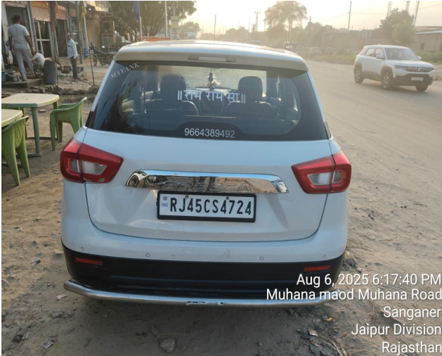
Aug 6, 2025 6:17:40 PM Muhana maod Muhana Road Sanganer Jaipur Division Rajasthan