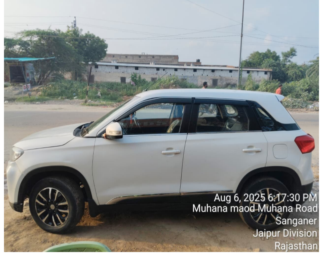
Aug 6, 2025 6:17:30 PM Muhana maod Muhana Road Sanganer Jaipur Division Rajasthan