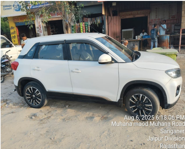
Aug 6, 2025 6:18:06 PM Muhana maod Muhana Road Sanganer Jaipur Division Rajasthan