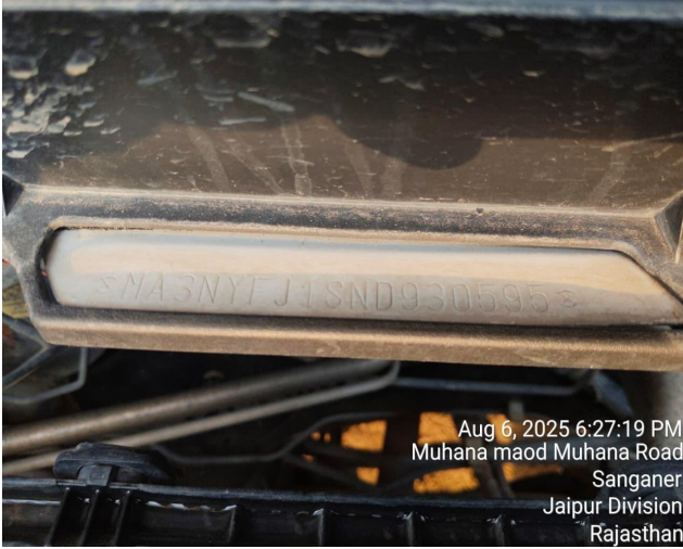
Aug 6, 2025 6:27:19 PM Muhana maod Muhana Road Sanganer Jaipur Division Rajasthan

Surveyor & Loss Assessor (SLA / 65869 Valid up to 27-09-27)