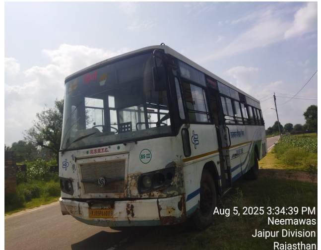
Aug 5, 2025 3:34:39 PM Neemawas Jaipur Division Rajasthan