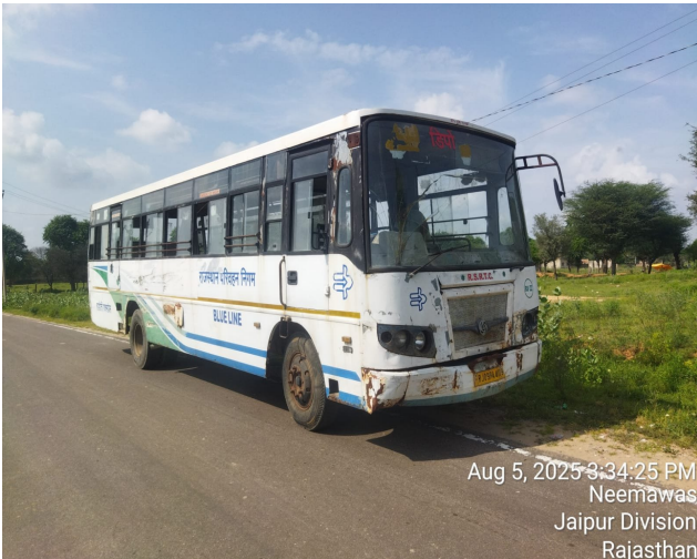
Aug 5, 2025 3:34:25 PM Neemawas Jaipur Division Rajasthan