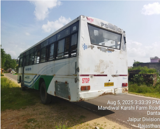
Aug 5, 2025 3:33:39 PM Mandiwal Karshi Farm Road Danta Jaipur Division Rajasthan