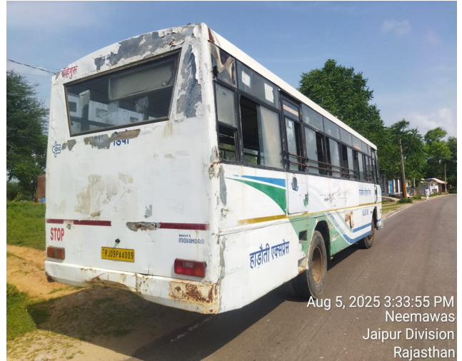
Aug 5, 2025 3:33:55 PM Neemawas Jaipur Division Rajasthan