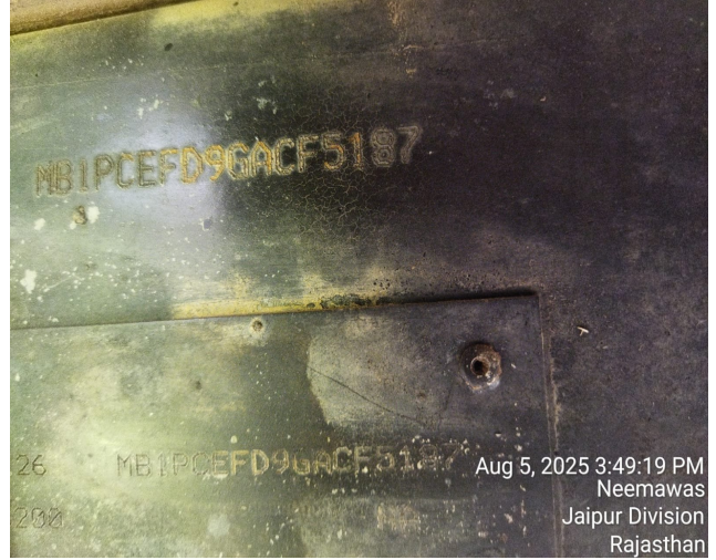
Aug 5, 2025 3:49:19 PM Neemawas Jaipur Division Rajasthan