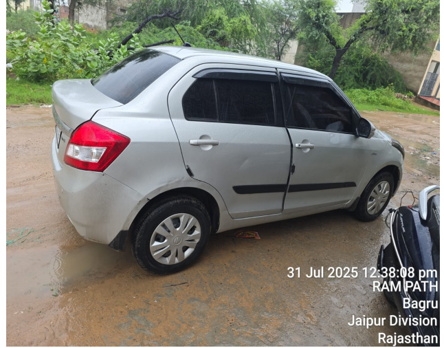
31 Jul 2025 12:38:08 pm RAM PATH Bagru Jaipur Division Rajasthan