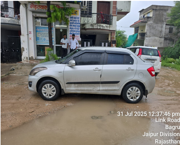
31 Jul 2025 12:37:46 pm Link Road Bagru Jaipur Division Rajasthan