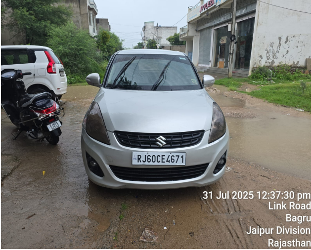
31 Jul 2025 12:37:30 pm Link Road Bagru Jaipur Division Rajasthan

Surveyor & Loss Assessor (SLA / 65869 Valid up to 27-09-27)