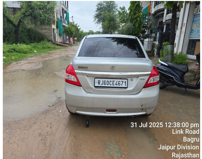
31 Jul 2025 12:38:00 pm Link Road Bagru Jaipur Division Rajasthan