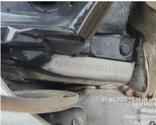
31 Jul 2025 12:39:04 pm RAM PATH Bagru Jaipur Division Rajasthan