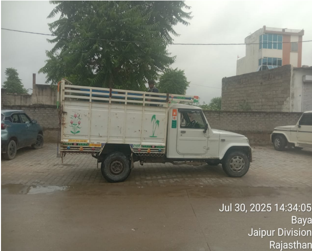
Jul 30, 2025 14:34:05 Baya Jaipur Division Rajasthan