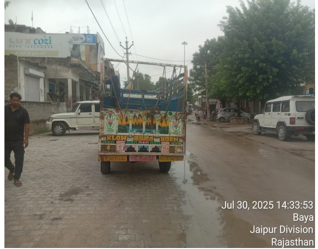
Jul 30, 2025 14:33:53 Baya Jaipur Division Rajasthan