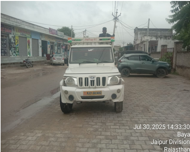
Jul 30, 2025 14:33:30 Baya Jaipur Division Rajasthan