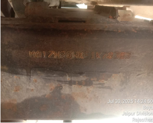
Jul 30, 2025 14:24:50 Baya Jaipur Division Rajasthan

Surveyor & Loss Assessor (SLA / 65869 Valid up to 27-09-27)