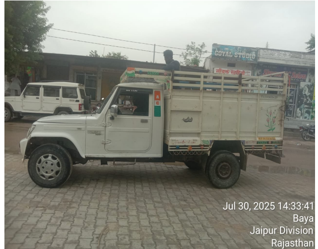
Jul 30, 2025 14:33:41 Baya Jaipur Division Rajasthan