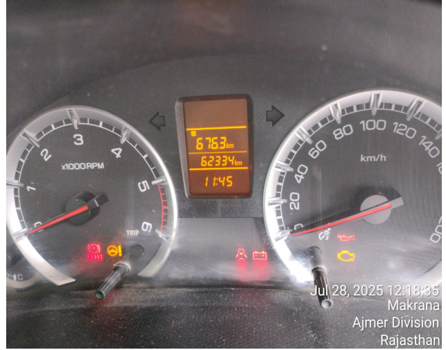
Jul 28, 2025 12:18:35 Makrana Ajmer Division Rajasthan