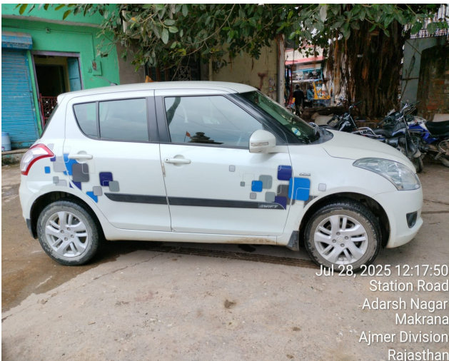
Jul 28, 2025 12:17:50 Station Road Adarsh Nagar Makrana Ajmer Division Rajasthan