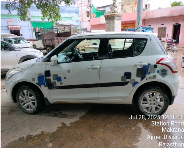
Jul 28, 2025 12:18:16 Station Road Makrana Ajmer Division Rajasthan