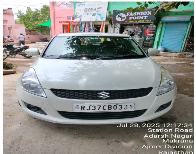
Jul 28, 2025 12:17:34 Station Road Adarsh Nagar Makrana Ajmer Division Rajasthan