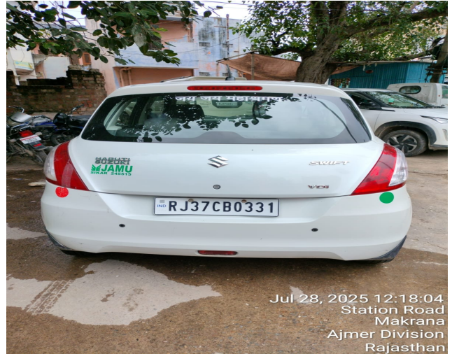
Jul 28, 2025 12:18:04 Station Road Makrana Ajmer Division Rajasthan