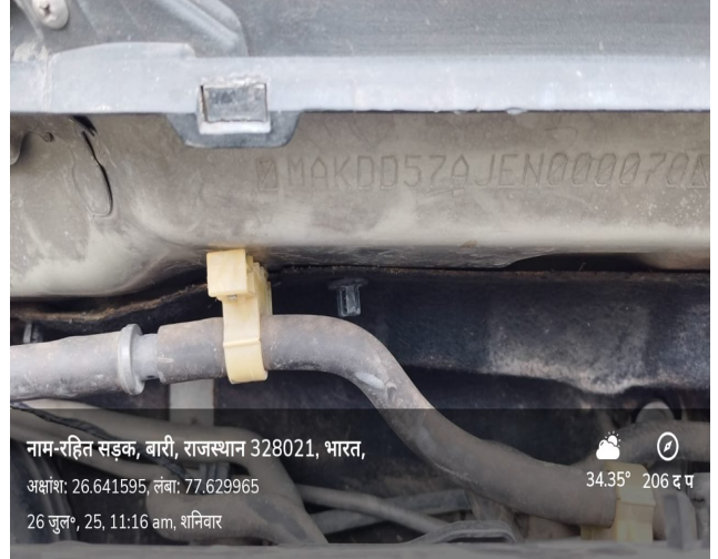
नाम-रहित सड़क, बारी, राजस्थान 328021, भारत, अक्षांश: 26.641595, लंबा: 77.629965 26 जुल, 25, 11:16 am, शनिवार