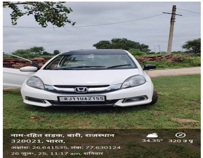
नाम-रहित सड़क, बारी, राजस्थान 328021, भारत, अक्षांश: 26.641535, लंबा: 77.630124 26 जुल, 25, 11:17 am, शनिवार