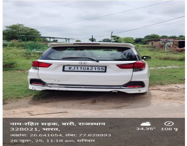
नाम-रहित सड़क, बारी, राजस्थान 328021, भारत, अक्षांश: 26.641654, लंबा: 77.629993 26 जुल, 25, 11:18 am, शनिवार