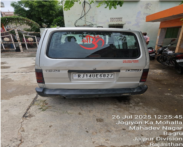
26 Jul 2025 12:25:45 Jogiyon Ka Mohalla Mahadev Nagar Bagru Jaipur Division Rajasthan