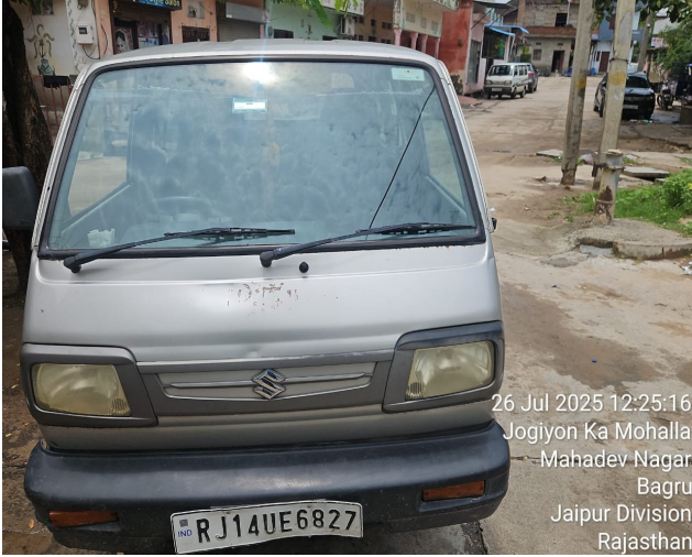
26 Jul 2025 12:25:16 Jogiyon Ka Mohalla Mahadev Nagar Bagru Jaipur Division Rajasthan

Surveyor & Loss Assessor (SLA / 65869 Valid up to 27-09-27)