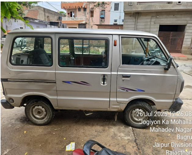
26 Jul 2025 12:26:08 Jogiyon Ka Mohalla Mahadev Nagar Bagru Jaipur Division Rajasthan