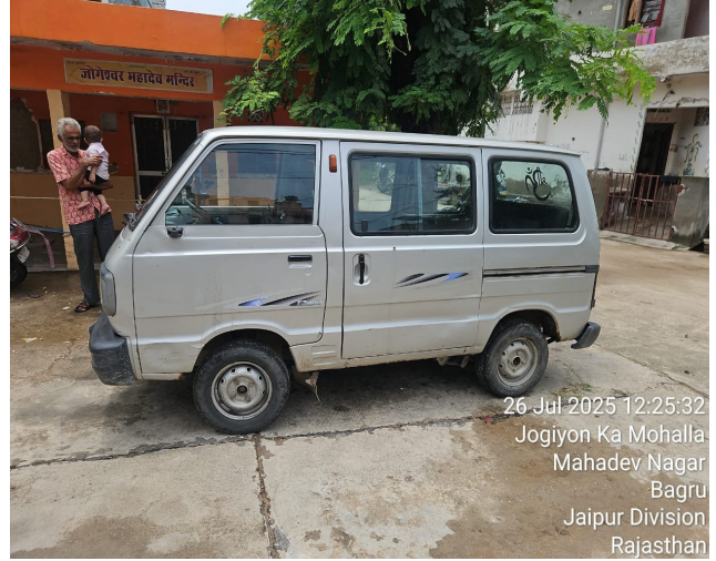
26 Jul 2025 12:25:32 Jogiyon Ka Mohalla Mahadev Nagar Bagru Jaipur Division Rajasthan