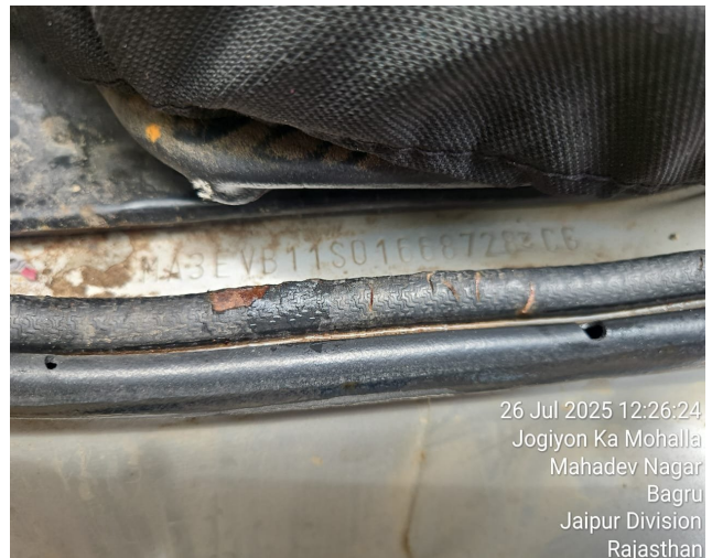
26 Jul 2025 12:26:24 Jogiyon Ka Mohalla Mahadev Nagar Bagru Jaipur Division Rajasthan